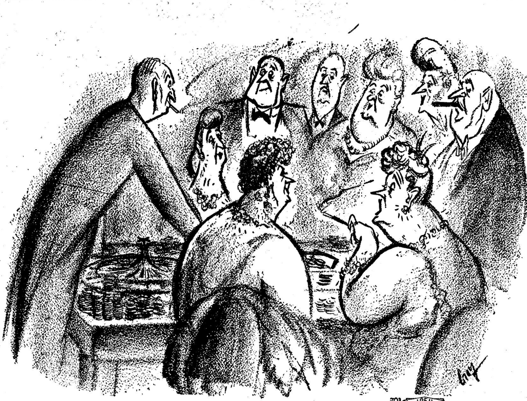
"The next war will put us in the Morgan class!"

Make your influence felt in labor's councils by pushing the only program that can succeed in throwing back Wall Street's anti-labor drive. Fill out the coupon on Page 2 and mail it in.