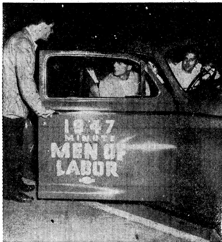
One of the lead cars of the California AFL-CIO motorcade with a sign on the door reading: "1947 Minute Men of Labor" as it reached Amarillo, Texas en route to Washington to protest the Taft-Hartley bill.