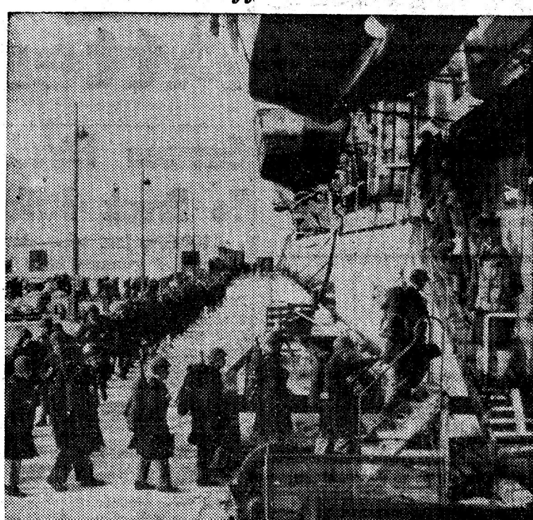
Armed with tanks, guns and other combat equipment, almost 1,000 Marines board a transport sailing for the Mediterranean. According to the official announcement their mission is to reinforce battleship personnel in Greek and Italian waters.