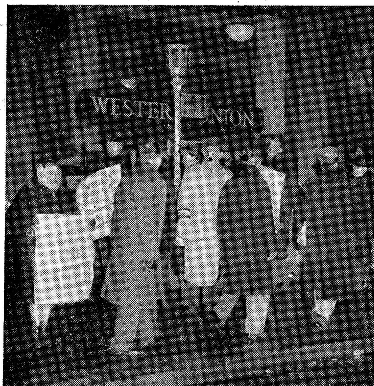
More than 3,000 members of the American Communications Assn. (CIO) walked off their jobs when the big four international telegraph companies refused to grant wage increases. Here pickets do their stint outside the Western Union office in New York.