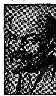
—Leon Trotsky, Address before Dewey Commission, Mexico City, 1937.

The experience of my life, in which there has been no lack either of successes or of failures, has not only not destroyed my faith in the clear, bright future of mankind, but, on the contrary, has given it an indestructible temper.