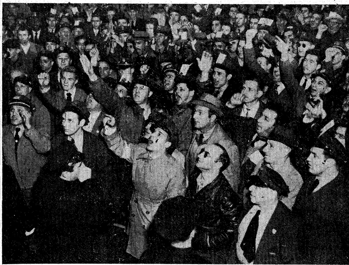
N. Y. bus drivers, members of the CIO Transport Union, howl down their International President, Michael Quill as he orders them back to work. The union called the men out on strike to win long-overdue retroactive pay. But after five hours, Quill called the strike off and informed the membership that only a "demonstration" had been intended. It was 24 hours before the bus drivers finally all returned to work.