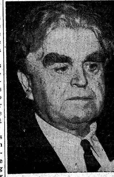
JOHN L. LEWIS

We by no means intend to give the Stalinists a clean bill of (Continued on page 2)