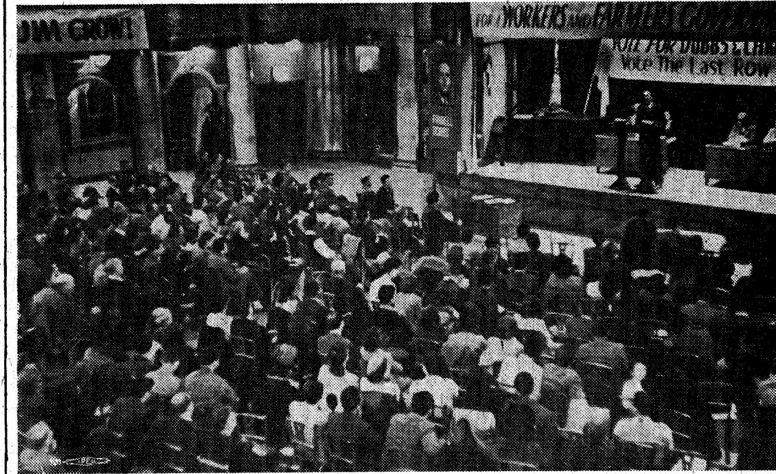
The final election rally in New York City held at the Hotel Diplomat. Farrell Dobbs, SWP Presidential candidate is addressing the audience.