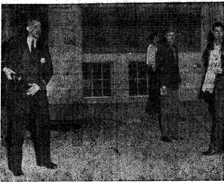
Police officer draws his gun as members of the CIO Steelworkers picket American Shuff Co. plant in Memphis, where violence has marked two-month strike.