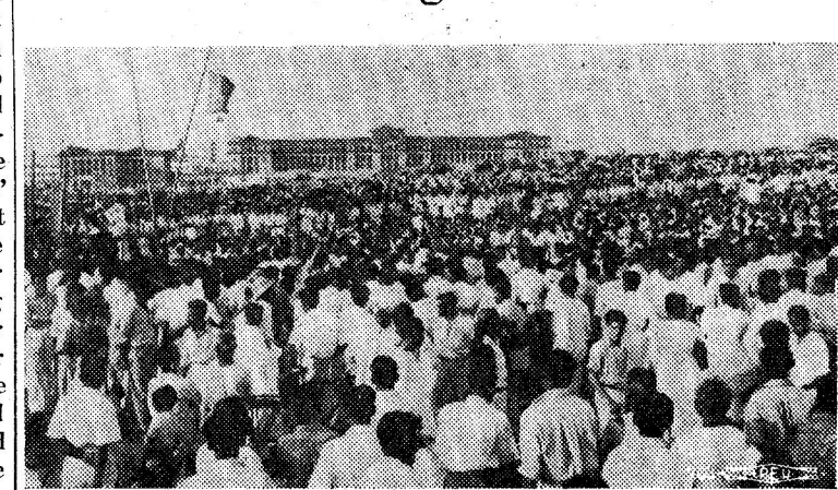
Shown above is part of the audience of 30,000 who assembled from all sections of Ceylon to attend the Trotskyist mass meeting at Colombo on Feb. 4, called by the two Trotskyist organizations who are in process of negotiating the unification of their forces.