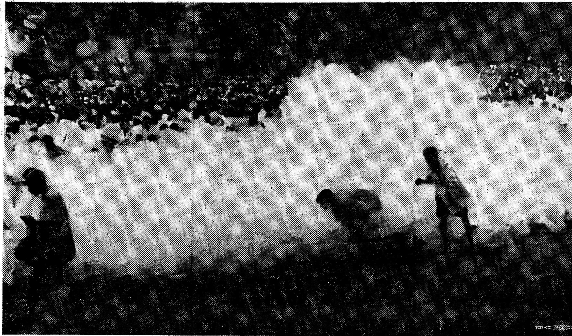
50,000 workers assembled at Kamgar Maidan (Bombay) on Aug. 29, in response to the call of the Hind Mazdoor Sabha, were brutally attacked and teargassed by the Congress government's police. Even the capitalist papers admitted that the workers were completely peaceful and never made any attempt to attack the police.