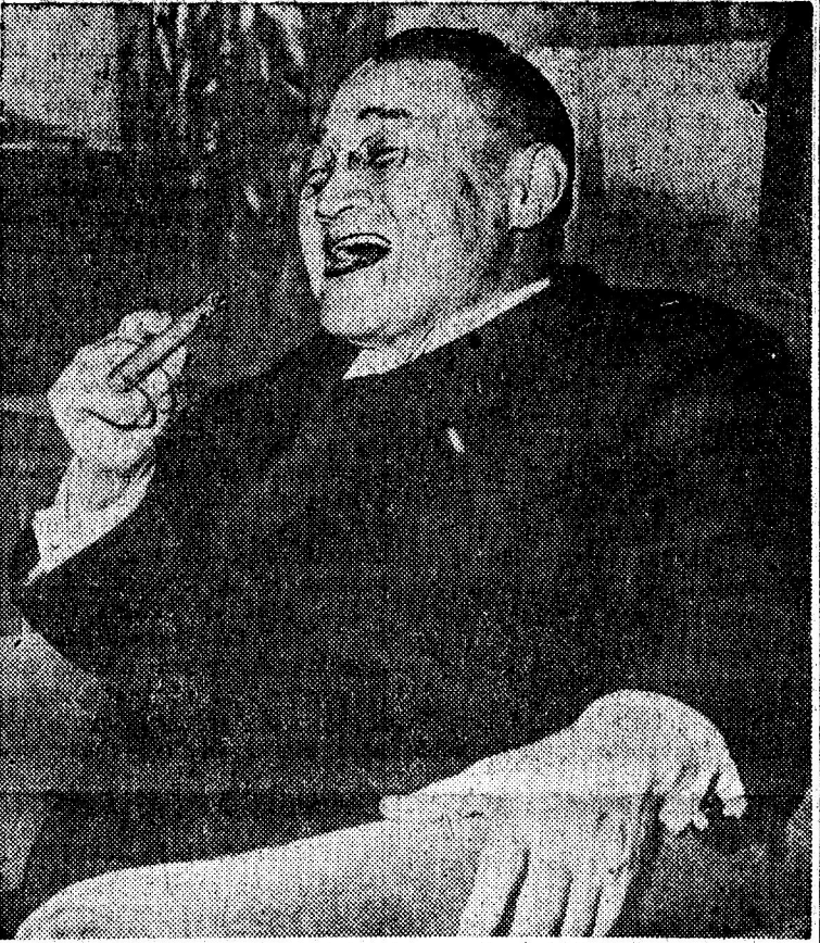
Japan's prime minister Shigeru Yoshida settles back in an easy chair with cigar after the signing of the Japanese peace treaty in San Francisco. Treaty pleases Japanese militarists and imperialists who will get a chance to revive Japanese imperialist power in the Far East. The treaty, however, keeps Japanese wardogs firmly on U.S. leash.