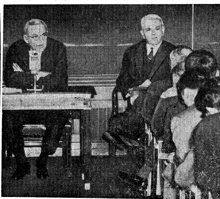
Sec. of State John Foster Dulles, (1), shown at his first Washington press conference, said his department is "studying" measures for increased "pressure" against People's Republic of China, including naval blockade of mainland. Object is to destroy Chinese revolution, drive people back to feudal-imperialist domination.