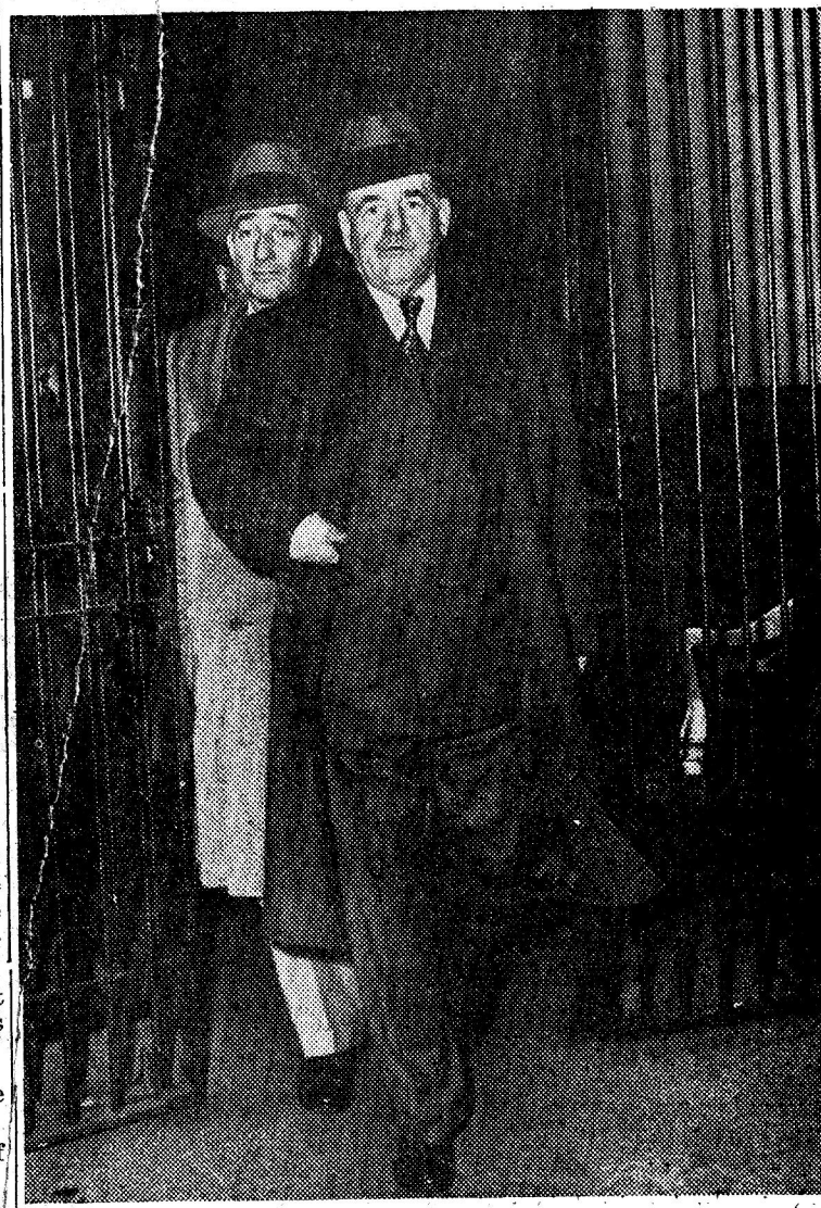
Arrested on a 30-count grand larceny indictment for stealing union funds, Pres. Jos. P. Ryan of AFL International Longshoremen's Assn. walks past iron bars in New York police station to be booked and fingerprinted. Ryan used union money for pleasure trips, clothes, cars, etc.