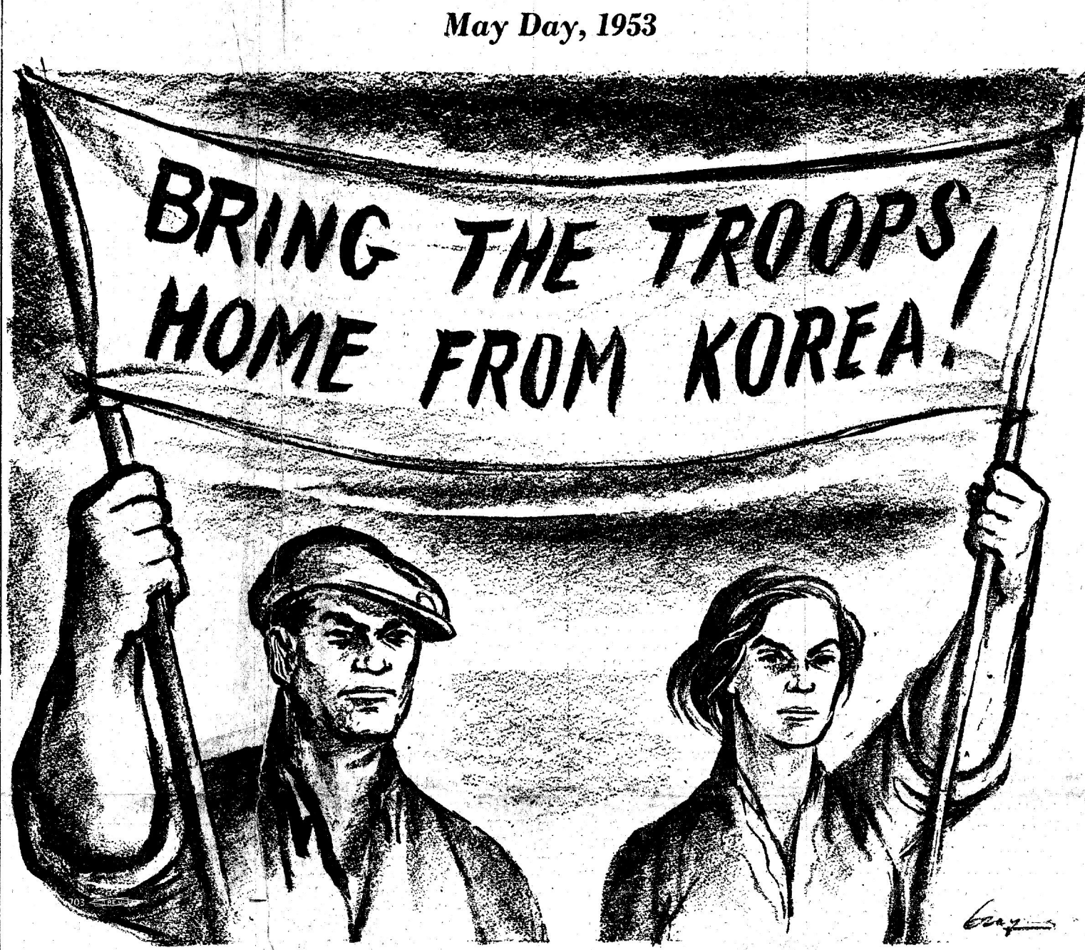
May Day, 1953