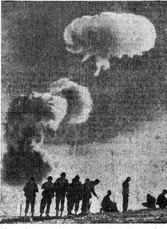
U.S. troops are shown silhouetted against a Nevada sky as the mushroom from an atomic bomb blast looms high above. This explosion was the eighth in the current series by the Atomic Energy Commission. Army command is trying to prepare soldiers for atomic war. In these tests, the GIs are kept well out of range and protected. In real warfare, they won't face such ideal conditions.