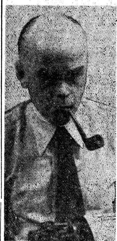
CEDRIC BELFRAGE, British-born editor of weekly National Guardian, was arrested and taken to Ellis Island for possible deportation after McCarthy's Senate Investigating Subcommittee and House Un-American Committee demanded his expulsion for criticizing their witch hunt activities.