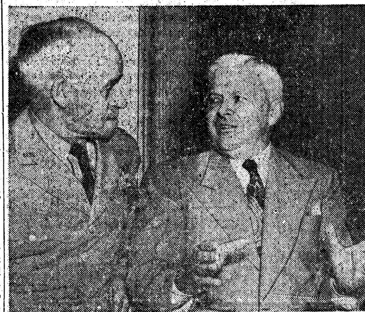
Gen. Omar N. Bradley (L), retiring chairman of Joint Chiefs of Staff, with Defense Secretary Charles E. Wilson, former General Motors president. Bradley spoke against any cuts in war spending and claimed American people must shell out at least $36 billion a year for war purposes "far into the future."