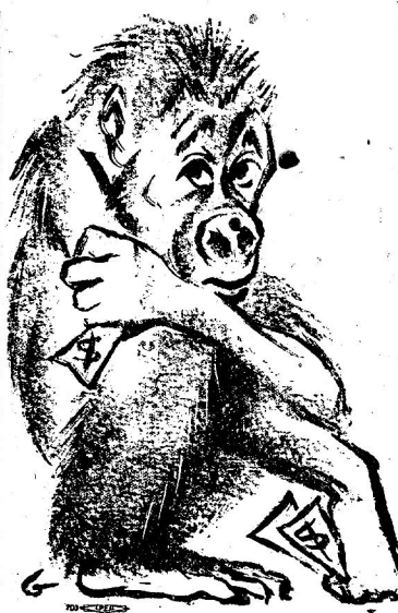
Yale Laboratories of Primate Biology. It was an ingenious effort to determine whether the character of a chimpanzee can be changed.