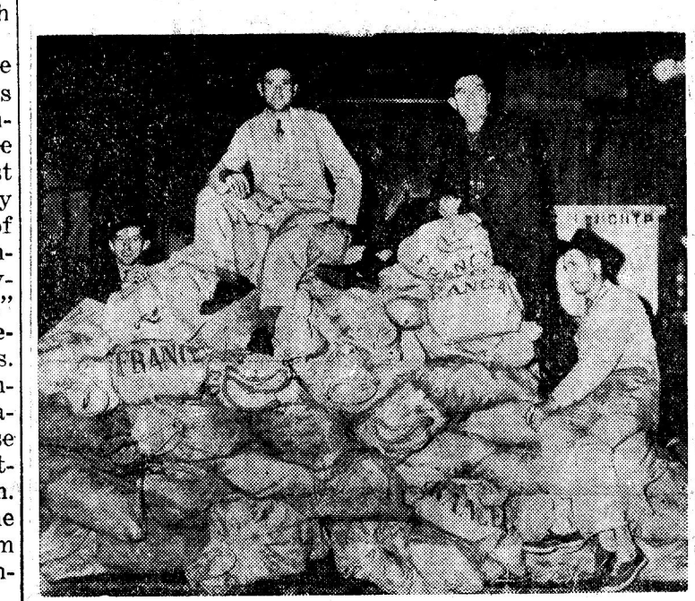
These striking postal workers in Paris rest on top of a mountain of unsorted, undelivered mail. They have joined in the general strike of four million workers throughout France against the "economy" measures of the Laniel government which hit at the already low living standards.