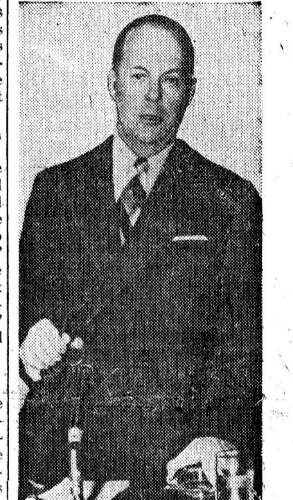
SEN. KARL MUNDT, who is subbing for his political associate McCarthy as chairman of the Senate Investigating subcommittee running probe.

In order to come out on top in the present dispute McCarthy does not have to prove the truth of his "blackmail" charges against Stevens, or to disprove Stevens'