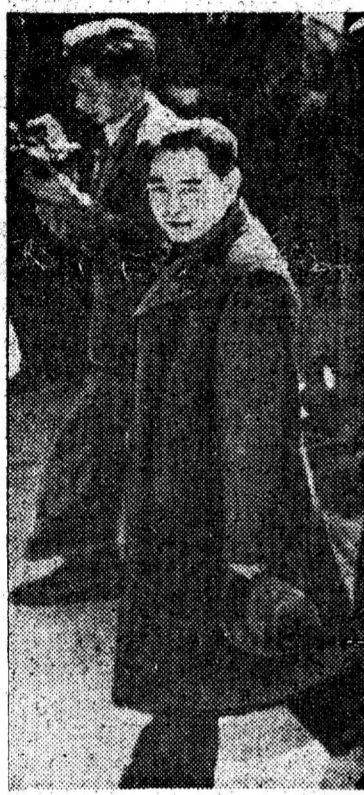
CHOU EN-LAI, Chinese Premier, shown arriving at Geneva Conference.

There is no question that American imperialism is receiving another serious reverse at the hands of the colonial revolution — this time in Indo-China. The Eisenhower Administration has had to back down from its initial intention of sending U.S. troops to the rescue of the French imperialists. This is a momentous event. In Korea, American imperialism was fought to a draw by the rising Asian revolution; in Indo-China, American imperialism has been halted dead in its tracks at least for the