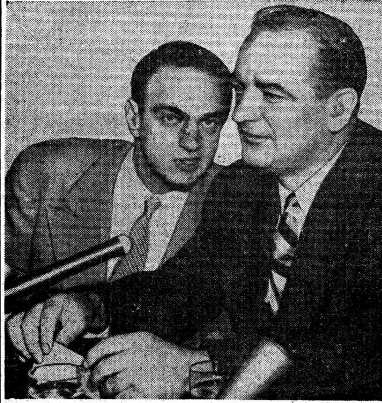
Sen. Joseph R. McCarthy and Roy Cohn (left), the fascist senator's chief counsel, shown in whispered conference during the McCarthy-Army probe before the Senate investigations subcommittee, which McCarthy runs. (See story on Page 1.)