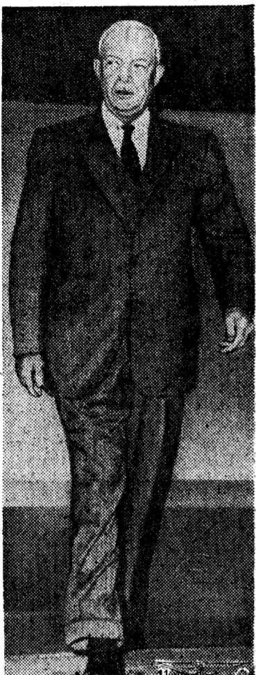
EISENHOWER leaving press conference after stating opposition to a proposed ban on sending U.S. troops to Indo-China without congressional consent. Americans are overwhelmingly against intervention. (See article on Page 2.)

IMPERIALIST DEAL Defeated on the field of battle, the imperialists — American, French and British — now would like to cheat the Indo-Chinese (Continued on page 3)