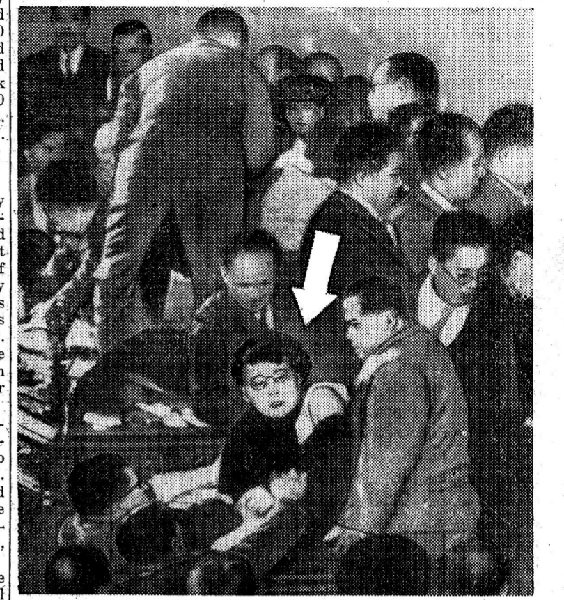
Lawmakers in the lower house of the Japanese Diet in Tokyo are shown at the height of a free-for-all over a move to extend the session illegally in an attempt to push through a bill increasing the national police force as the base for a new military machine. Socialist members opposed the bill, including the woman legislator with ripped clothing (arrow). 56 were hurt, one seriously, in the 20-minute pitched battle.