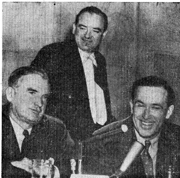
Sen. Stuart Symington (D., Mo.), left, Sen. Joseph McCarthy (R., Wis.), standing, and Sen. Henry Jackson (D., Wash.), right, all "smile for the birdie" during a breather in the Senate Investigations subcommittee's hearings on the McCarthy-Army dispute.