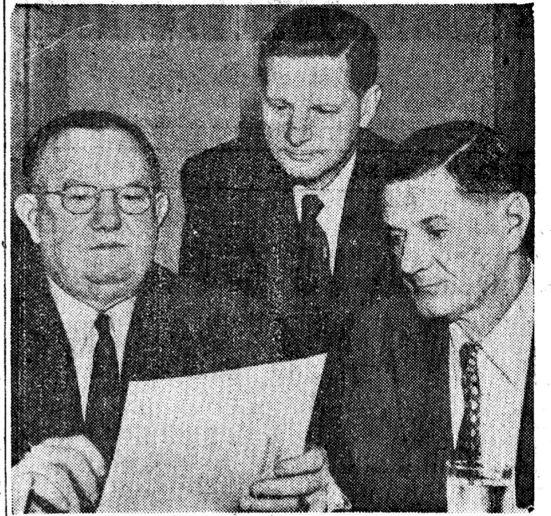
Discussing Senate probe of FHA frauds, housing chief Albert Coles (center) confers with chairman Homer Capehart of Senate Banking Committee and Sen. Burnett Maybank. Senate hearings have already revealed that building contractors made profits of 10,000% and more on housing deals financed by FHA.