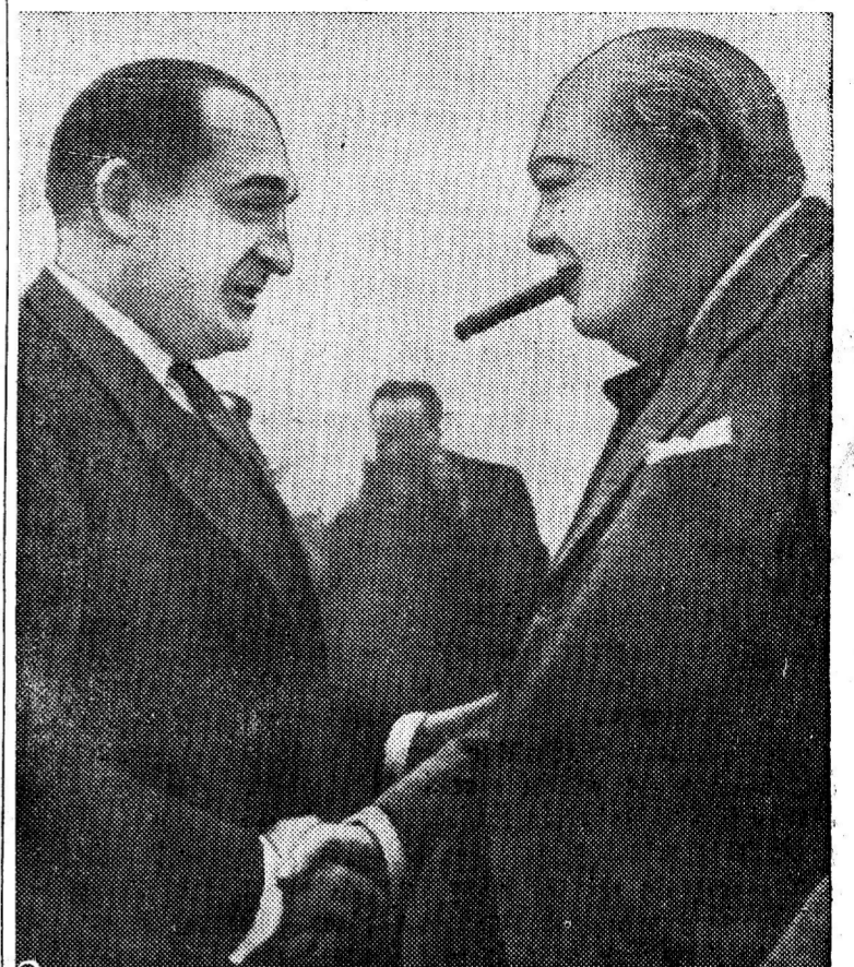
Prime Minister Winston Churchill greets French Premier Mendès-France, who flew to England to seek support for his efforts to modify the EDC treaty so that the French Assembly might pass it. Churchill was friendly but unhelpful. The Assembly was neither friendly nor helpful, killing EDC by 319 to 264.