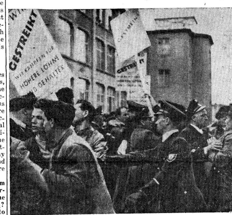
Police and strikers clash outside a metal factory in Munich, Germany, following a walkout of 220,000 Bavarian workers seeking wage increases. The fighting started when police tried to escort scabs into the plant. Nine persons were injured in this dispute. Full strike figures from all parts of Germany have been blacked-out in the U.S.