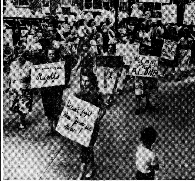
White women picket Public School 22 in Baltimore protesting integration of Negro children. For the white supremacists, the demonstration served as pressure against the Supreme Court which meets Dec. 6 to consider enforcement of its anti-segregation decision.