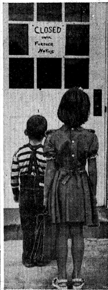
School children in Milford, Del., read the "closed until further notice" sign on their school after threats of violence were made over admission of Negro pupils. Schools were later reopened but the violence started in Milford spread to Washington and Baltimore.