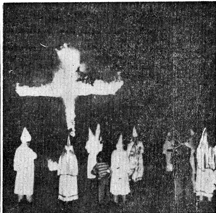
Picture of a recent cross-burning by Ku Klux Klansmen 15 miles from Atlanta, Ga. The hooded order is mobilizing against desegregation of school children.