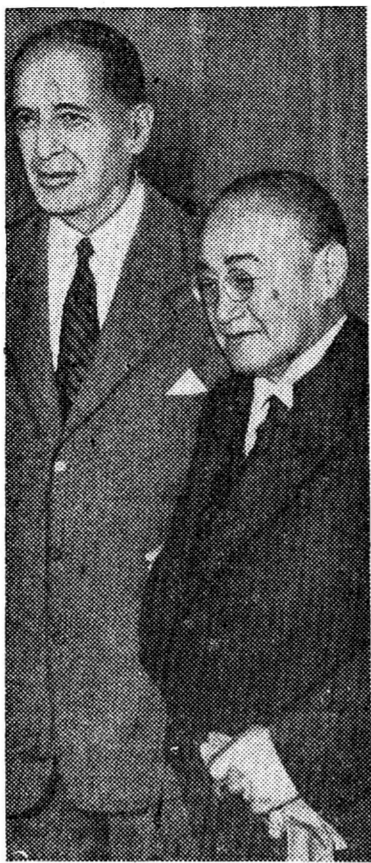
General Douglas MacArthur and Shigeru Yoshida, Japan's prime minister, meet in New York. They were enemies in World War II, when each sent youth of own country into slaughter for profits of own capitalist class. Yoshida came to U.S. hoping to get $4 billion to rearm Japan. Japanese war-lords, bankers and industrialists are now Wall Street's allies against Soviet bloc and colonial revolution.