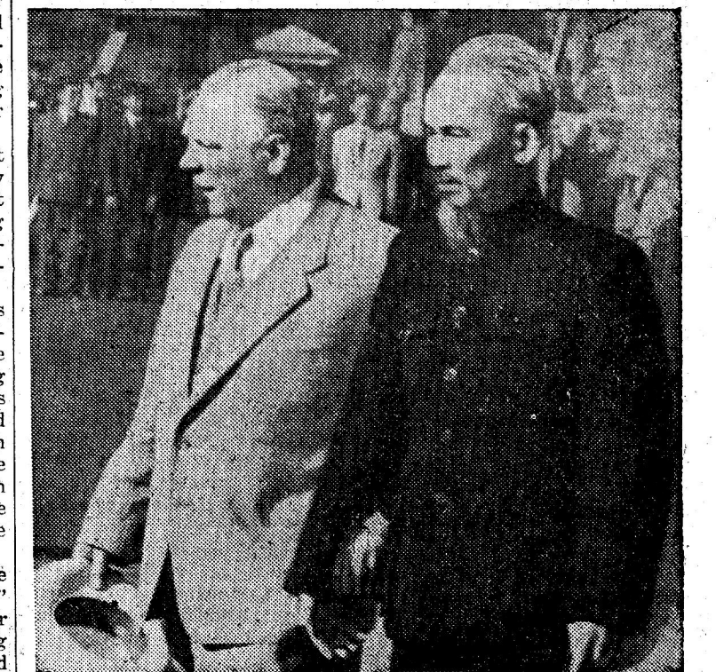
Premier Ho Chi Minh of North Viet Nam (right) is greeted in Moscow by Soviet President Klementy Voroshilov. The popular enthusiasm for the Indo-Chinese leader in Moscow reportedly exceeded official arrangements. One purpose of his visit, it was believed, was to find out if the Kremlin would stand by last year's Geneva treaty which promised unification elections for Viet Nam. The U.S. and South Viet Nam oppose holding such elections.