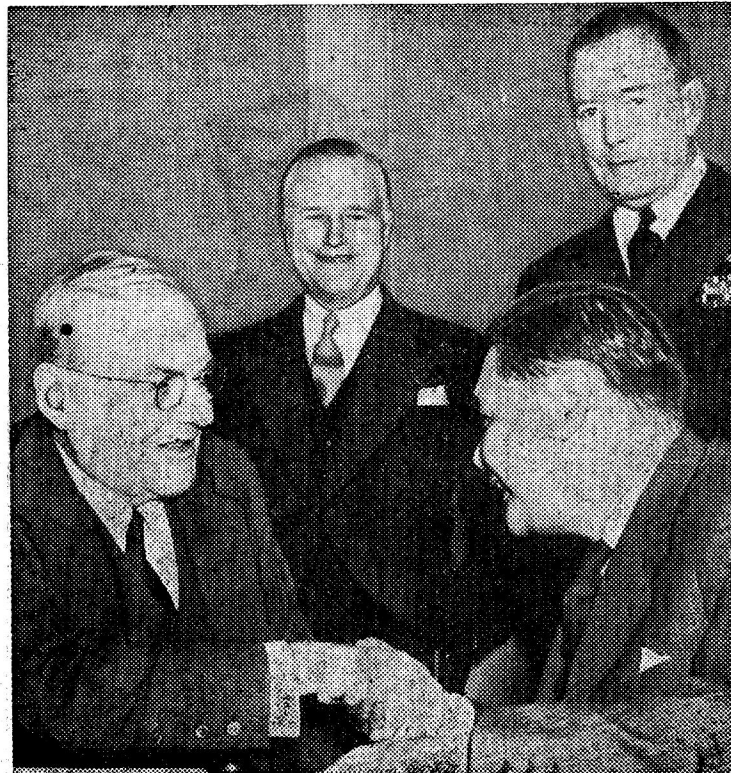
U.S. Secretary of State John Foster Dulles and George C. Yeh, foreign minister in dictator Chiang Kai-shek's cabinet on Formosa, shake hands in Washington last December after signing a "mutual security" treaty. The pact formally binds the U.S. to defend Chiang on the island where he was driven by the Chinese people and symbolizes Wall Street's long-range aim of smashing the new government put into office by the Chinese revolution.

hay" out of the visits was that motivated the State Department, then it would seem that Washington decided to keep the flyers in jail to make its own "propaganda hay" out of their plight.