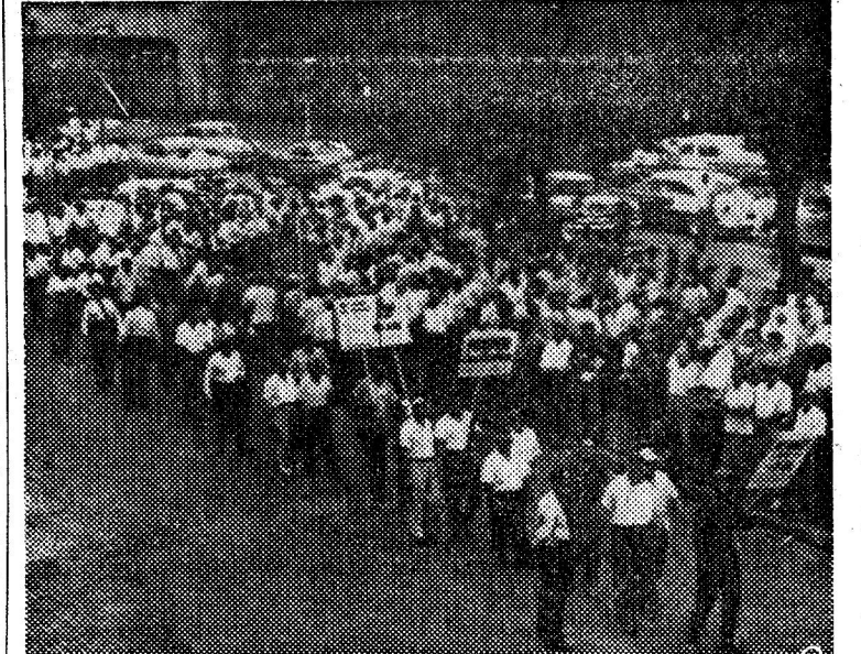
Workers picket the Intl. Harvester plant in Chicago, as 40,000 members of the United Auto Workers (CIO) struck 18 I. H. plants in six states to back up wage demands. Rank-and-file militancy was manifested in early walkouts and in the appearance of new fighting leadership in locals.