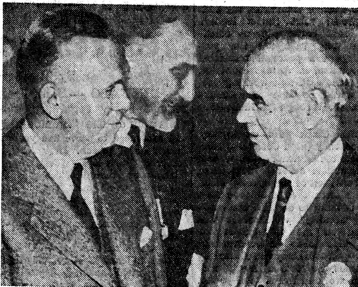
The late Philip Murray (right) shown with former Secretary of State George C. Marshall, at the 1947 CIO convention in Boston.

only about Stalin's crimes but some of their own. All of this mumbo jumbo is intended to conceal the true role of the American CP as a political agency of the Kremlin.