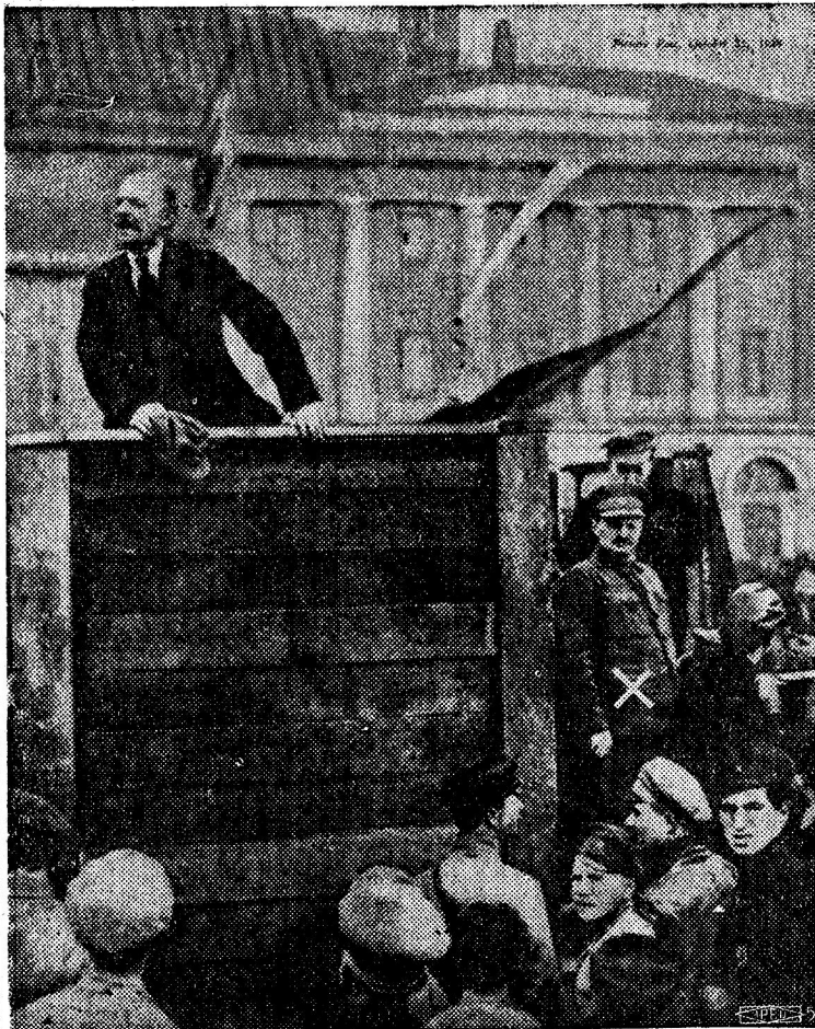
Lenin and Trotsky at an outdoor mass meeting to rally the workers in defense of the young Soviet Republic against the white guard and capitalist intervention armies. Lenin is seen addressing the audience. Trotsky, organizer of the Red Army, waits (on the right) to ascend the rostrum as the next speaker. For years the Stalinist picture-croppers, inside and outside the Soviet Union, have used this picture of Lenin, first having carefully "edited" Trotsky out of it.

Reactionary epochs like ours not only disintegrate and weaken the working class and its vanguard but also lower the general ideological level of the movement and throw political thinking back to stages long since passed through. In these conditions the task of the vanguard is above all not to let itself be carried along by the backward flow; it must swim against the current. If an unfavorable relation of forces prevents it from holding the positions that it has won, it must at least retain its ideological positions, because in them is expressed the dearly-paid experience of the past. Fools will consider this policy "sectarian." Actually it is the only means of preparing for a new tremendous surge forward with the coming historical tide. Great political defeats inevitably provoke a reconsideration of values, generally occurring in two directions. On the one hand the true vanguard, enriched by the experience of defeat, defends with tooth and nail the heritage of revolutionary thought and on this basis attempts to educate new cadres for the mass struggle to come. On the other hand