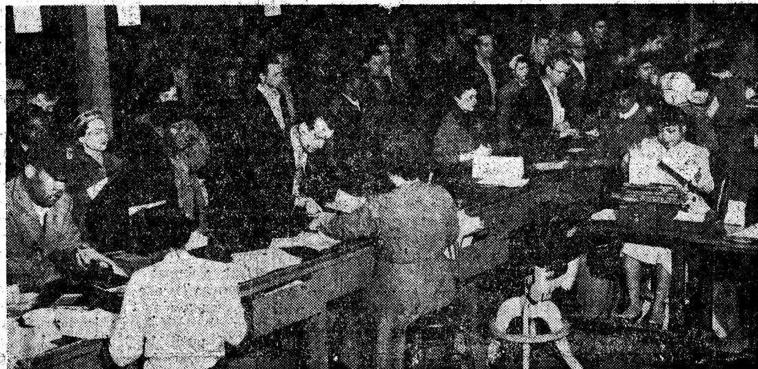
A common sight in the auto capital, Detroit, is the long lines of jobless outside unemployment compensation offices (top). Bottom picture shows unemployed auto workers filing applications for state unemployment compensation. Michigan's unemployed topped 220,000 at end of May. Over 90 per cent of auto jobless are ineligible for supplementary unemployment payments from companies because of loopholes in United Auto Workers contracts.