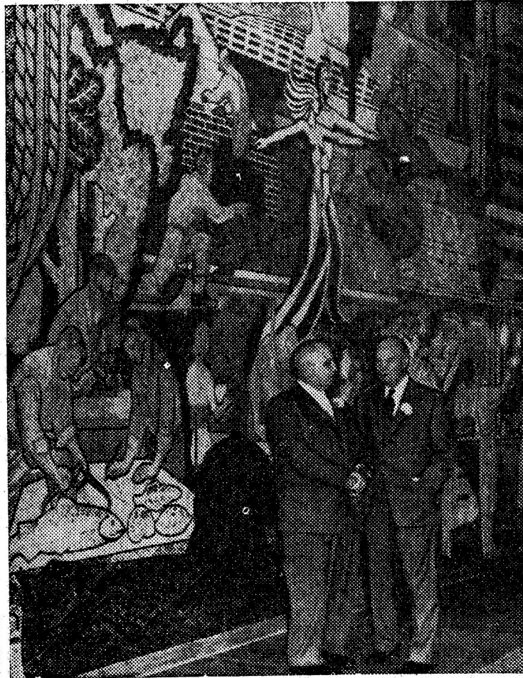
President Eisenhower (r) and AFL-CIO President George Meany are shown in the lobby of the new $4 million AFL-CIO building in Washington, after Eisenhower dedicated the new union headquarters. He said nothing about the role of unions as a means of defense by the American workers against Big Business exploitation. Instead, he warned organized labor not "to dominate" the individual.

on "socialism in one country at that time," and that he was right "in calling Trotsky a mischief maker." This was the only time in her entire speech that Trotsky was mentioned. She did not deal with the Moscow trials. None of the questions submitted on these subjects was answered during the question and answer period.