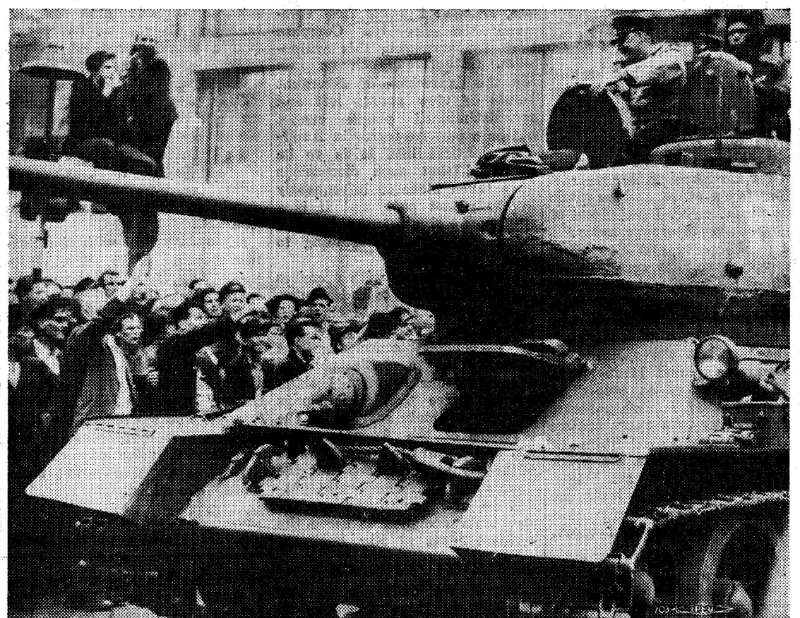
Pictured above is a Kremlin tank used by the Stalinist commander of the Soviet garrison in East Berlin against the East German general strike in June 1953 against Stalinist misrule. Last week the Stalinist regime in Poznan used such tanks against striking workers.

Thus the NAACP leaders adequately did one-half of their job — analyzed what was wrong in the present political situation as it affects the Negro struggle. But what did they do about the second-half — explaining what has to be done? After all, leaders are supposed to lead. Here their words added up to zero as far as practical steps are concerned. In the keynote address, Thurgood Marshall declared that the convention should present to both parties "minimum demands for strong uncompromising planks on civil rights." Such a minimum program is embodied in the resolutions passed by the convention. Neither party will accept this minimum program. What then does Marshall propose? When one presents minimum demands and they aren't met, what is the next step? The delegates weren't told. At the closing session, Roy Wilkins urged delegates to get out the vote: "If politics can be used for increasing corporation profits, there is nothing wrong in using politics to secure human rights."