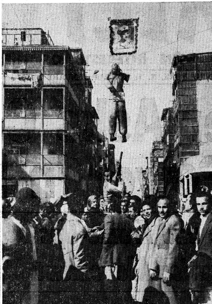
British Prime Minister Anthony Eden hangs in effigy in Port Said as Egyptian people express their determination to end imperialist rule. This demonstration took place as British and French forces withdrew from the country. Above effigy of Eden is portrait of Egyptian President Nasser.

losses already inflicted on the colonial empires of France, Britain and Holland, the loss of control over Middle-Eastern oil and the Suez Canal has a qualitative impact on the whole rotten structure of European capitalism. The full meaning of this radical alteration in the world situation has yet to dawn on the imperialist statesmen.