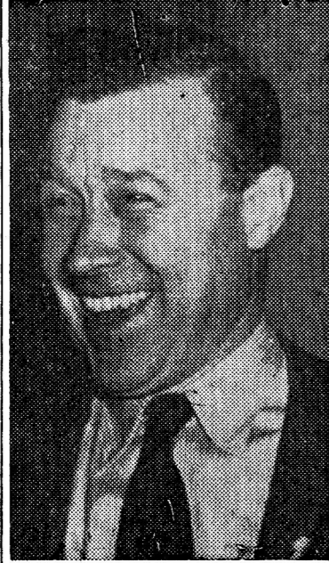
WALTER REUTHER (President of the UAW), whose pro-Democratic Party policy is being challenged in effect by proposals in the UAW to build a labor party.