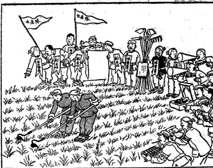
This cartoon appeared in May 1956 in the Peking People's Daily. An explanation says that there are too many non-productive persons in some agricultural Co-ops. This lowers both production and the income of Co-op members.