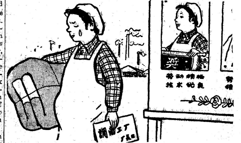
On July 7, 1956, the Peking People's Daily published this cartoon. The woman is carrying a discharge slip. In the poster she holds a production award. Discrimination against women is charged in some factories in An Shan.