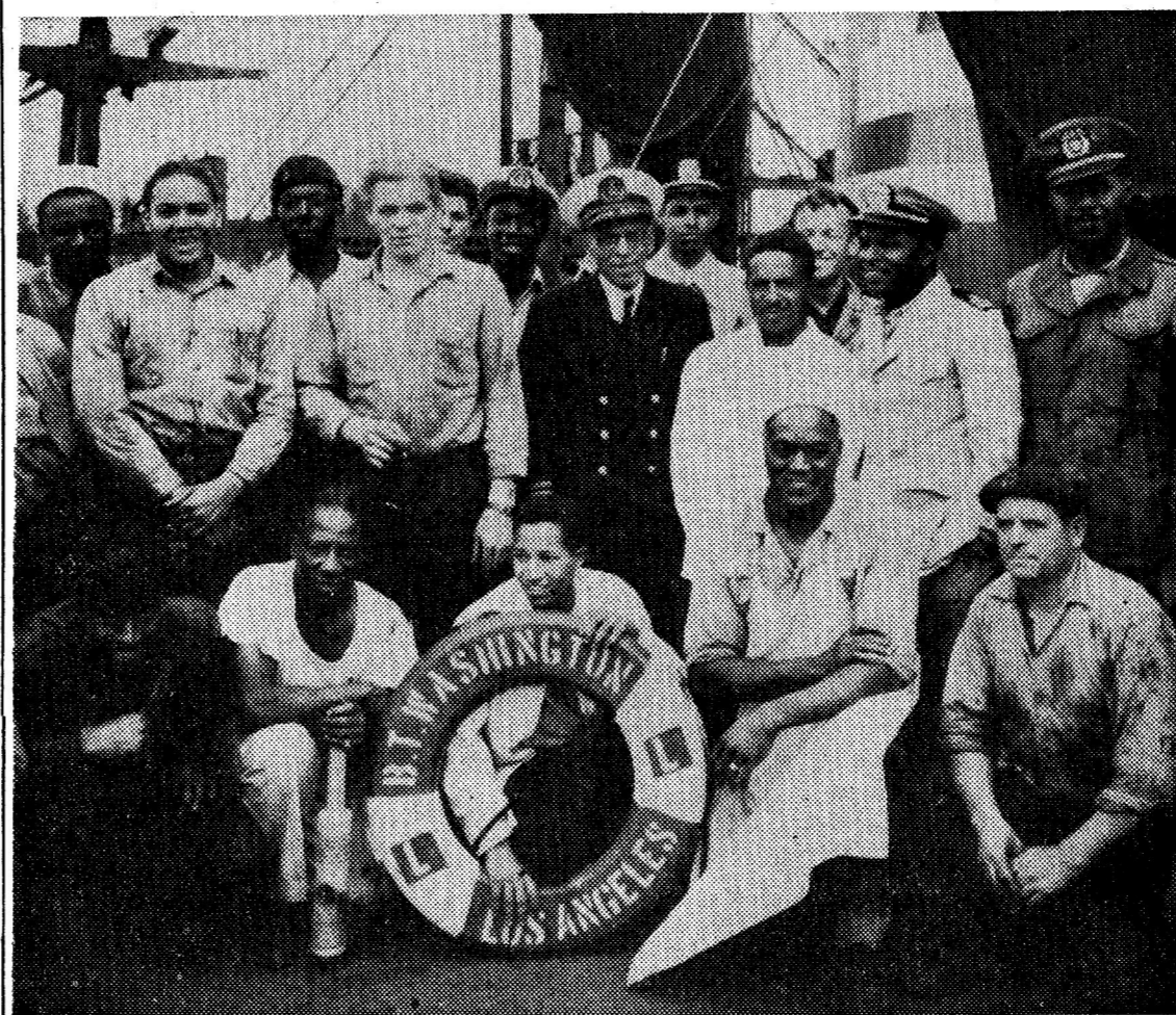
Captain Hugh Mulzac (center) and part of the crew of the S.S. Booker T. Washington in 1947. He recently got his papers back after being "screened" in 1950 because organizations that helped him fight Jim Crow in shipping had been deemed "subversive." A birthday celebration for the skipper will be held Saturday, March 23 at 8 P.M. at Esthonia Hall, 2051 Lexington Ave., Manhattan.