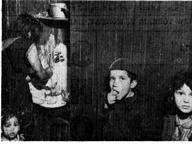
Scene in one of the "apartments" that makes East Harlem a rent-gougers' paradise. Puerto Rican and Negro families are jammed into these slum dwellings and rents of $15 to $25 a week are extorted for such one-room "remodeled" dwellings.

rarely see a story in the papers about a delinquent youth whose family has lived in this country for generations and who is blond and blue-eyed; although boys of this description do commit crimes.