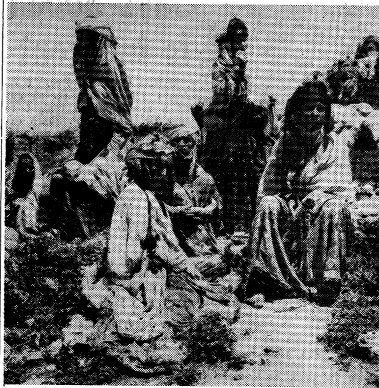
Women survivors of Melouza massacre. This village supported the MNA, the left wing of the Algerian nationalist movement. A guerrilla band invaded the village, took all the men—over 300—prisoner and killed them. The MNA charges the crime to the right-wing FLN which is trying to crush the MNA by force.

their homes in Tunisia and Morocco, leaving a certain amount of economic space for a native commercial capitalist class and a stratum of intellectuals to develop.