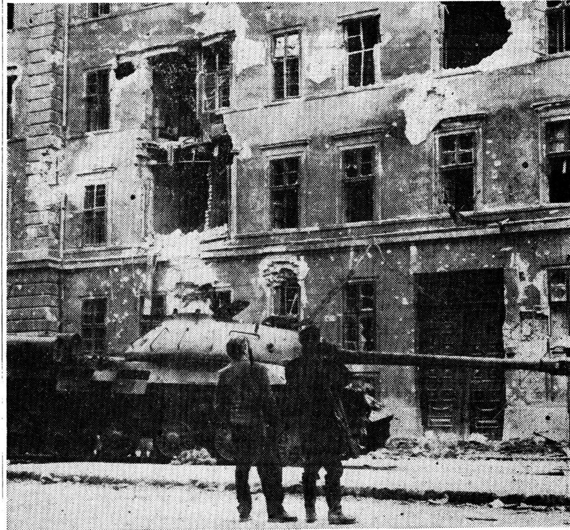
Scene above shows the Kilian Barracks in Hungary in 1956 after the revolutionary fighters had been driven out. It was here that General Pal Maléter, veteran Communist, heroically fought for "the creation of a Hungarian socialism on a really democratic basis." He has since been secretly tried and executed by the Kremlin.

Oct. 29: A delegation representing students of Sopron reported their views in Győr: "Many of the demands of the Sopron students agree with the demands made by the trade unions and the Petofi Club . . . [but] they do not agree with the present composition of the Parliament and the government . . . They demand that a new parliament be formed from rep-