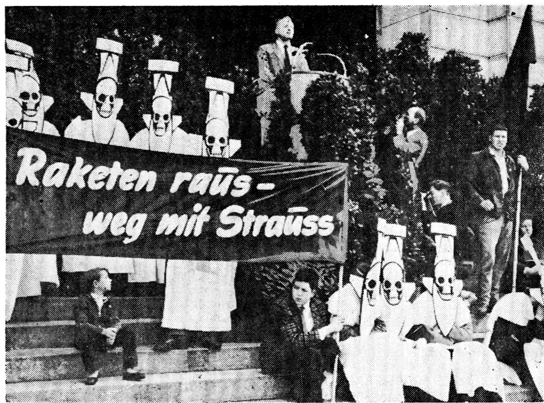
A demonstration of 40,000 in Hanover, Germany, meet to protest arming Germany with nuclear weapons. The banner reads, "Away With Rockets — Away With [Josef] Strauss" (West German defense minister). West Germans are opposed to their country being used as a military base for atomic war preparations.

W. Germans Demonstrate Against A-Weapons