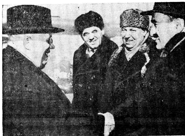
Khrushchev, left, shaking hands with Anastas Mikoyan, right, is greeted in Moscow after a visit to Hungary. The Kremlin boss is responsible, directly or indirectly, for the secret trial and execution of four Hungarian Communist leaders.