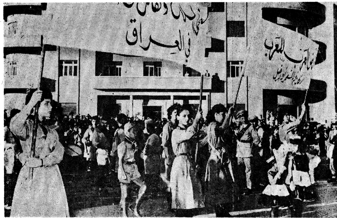
Syrian youth marching past Government House in Damascus. They are celebrating the signing of a pact of mutual defense between the United Arab Republic and the new Iraq government. Signing the pact of friendship with Nasser's government was one of the first acts of the new regime.