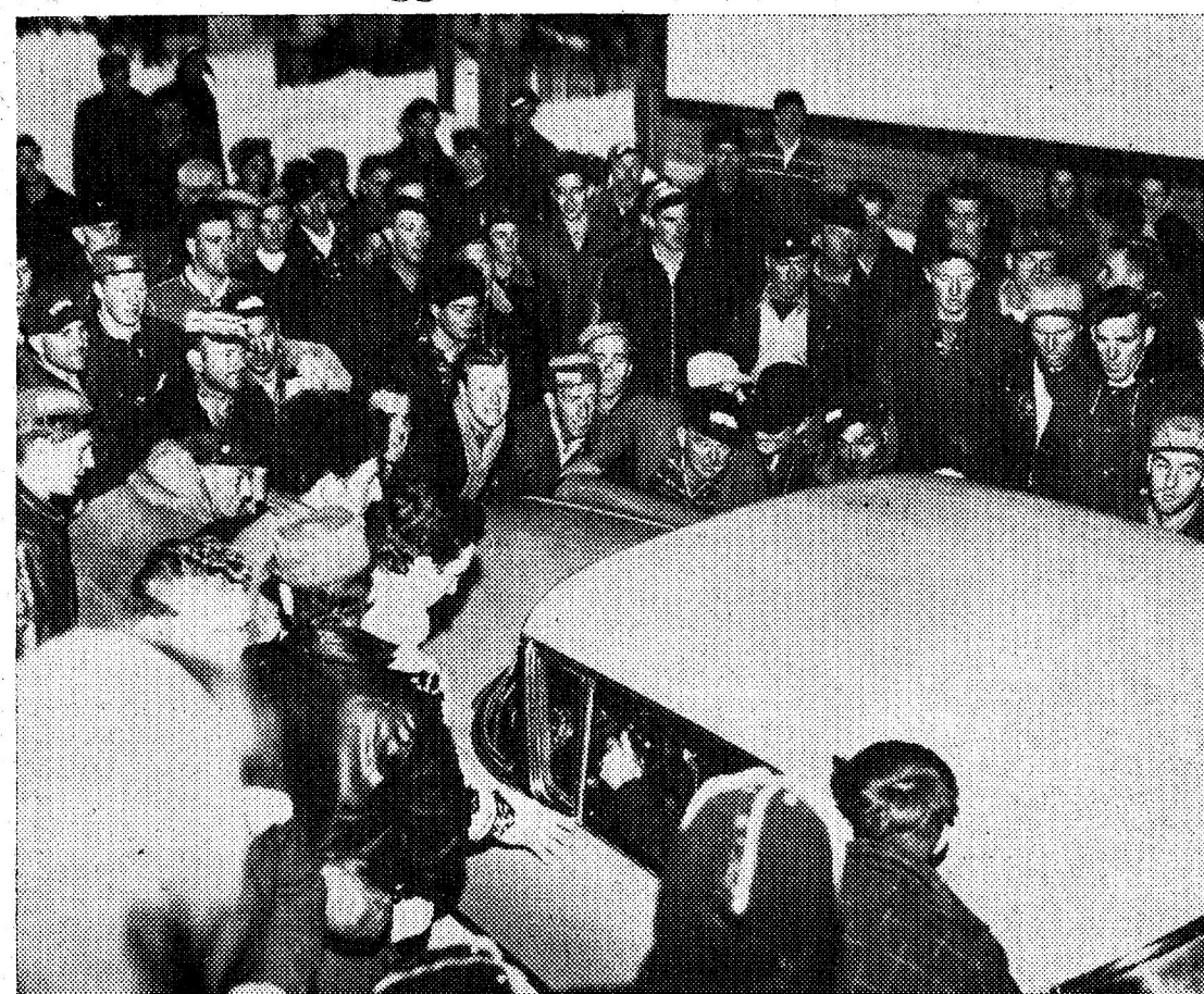
Striking Newfoundland members of the International Woodworkers of America block passage of carload of scabs. Fighting against a 60-hour week and low pay, the loggers are standing up against club-swinging, trigger-happy Canadian Mounted Police. The Canadian Labor Congress is seeking to collect $1 from each of its million members to aid the strike.