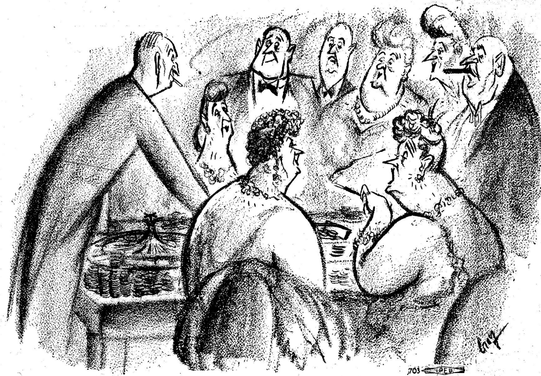
"You're right. We could lose our shirts gambling on an agreement with the Russians!"

China's revolution against imperialism finally won out in 1949, when the CP-led armies crushed Chiang Kai-shek's forces and drove the erstwhile "progressive bourgeoisie" off the mainland. In the ensuing years, China abolished capitalist property relations altogether and instituted national ownership and planning. This is the course Latin America's revolution against Wall Street will also have to take if it is to triumph.