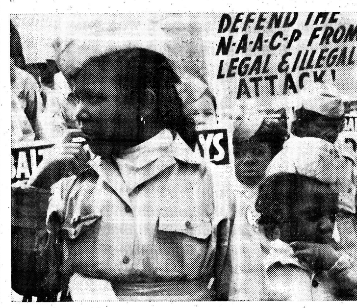
In the biggest demonstration ever held in Washington, 26,000 youth, Negro and white marched with banners demanding immediate school integration. Above is part of delegation from City College of New York, one of many campus groups that turned out. Below, two of the youngest participants wait for march to begin.

sergeants were afraid to touch the sign. "Leave it alone! Throw them out!" Democratic Lt. Gov. John Swainson finally restored order, got the sign down and adjourned the session so the delegates could talk to the senators. The rank-and-file UAW leaflet distributed at the conference supported jobless compensation for the duration as "the only proposal that takes into consideration the plight of all the unemployed." Most of it was critical of the union leaders' failure to fight for a shorter work week. It said: "We need a 30 hour week with no cut in takehome pay. "The national AFL-CIO Council has declared in favor of a 35 hour week. We welcome the Council's action as a step in the right direction and favor passage of Senator McNamara's 35 hour bill which has already been introduced in the Senate. "It's not enough to say that we favor the 35 hour week and then let it get buried in a long list of 'ultimate' and 'long range' objectives. "We must fight for a shorter work week now if we hope to win it in the foreseeable future. "We must throw the full weight of the labor movement behind a fight to achieve this objective. We must put pressure on all of Congress to declare