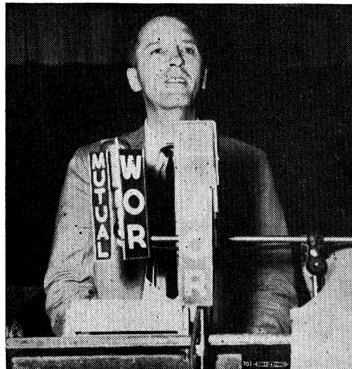
Farrell Dobbs, 1956 SWP Presidential candidate, bringing message of socialism to the American people in a broadcast made possible by "equal-time" law. Current moves to kill law are designed to limit air waves to candidates of Big Business.

(Continued from Page 1) tion campaigns because the stations could not give equal news coverage to an allegedly vast number of "splinter" and "crackpot" candidates.