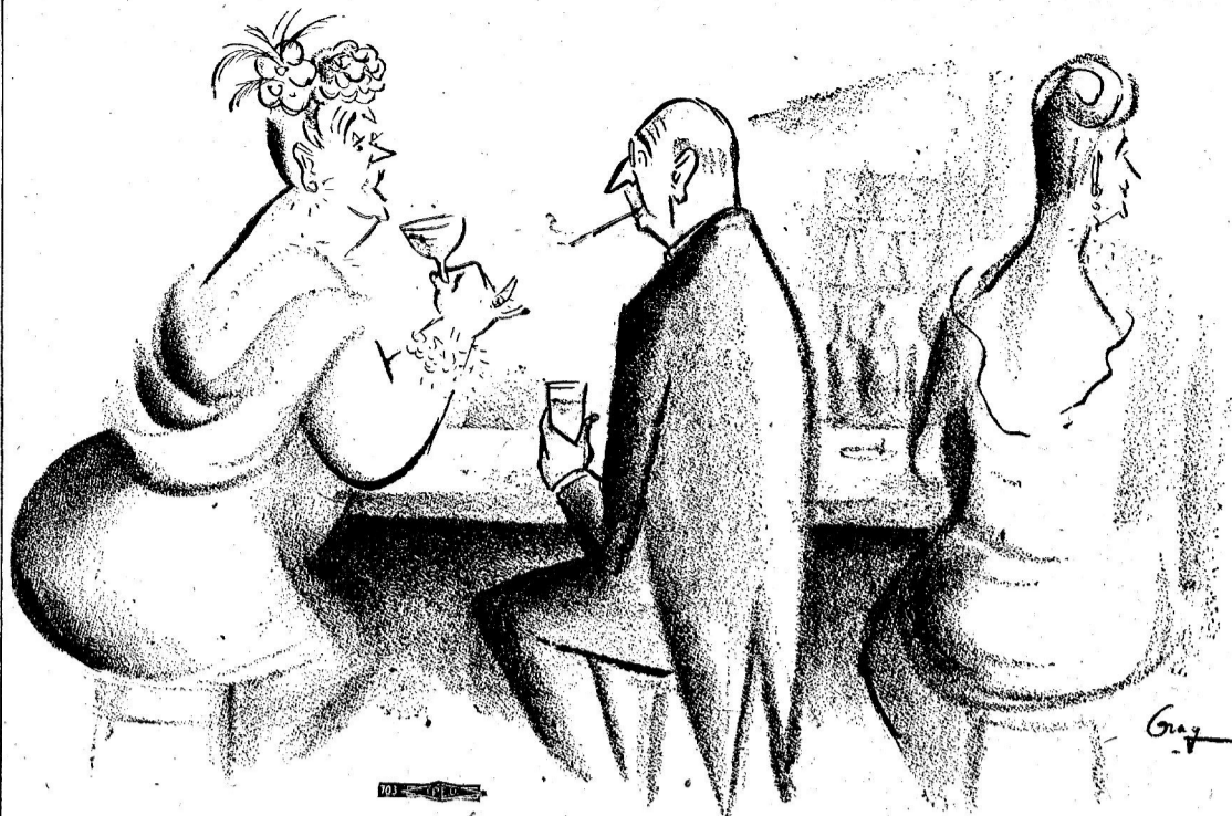
"And I told the guide at that Russian exposition that if they think they're going to seduce us with their vodka..."

pensive, drawn-out court fight. The security program has been a basic component of the overall witch-hunt which has corroded American public life for the past dozen years. Yet the court evaded the constitutional issues involved, deliberately confining itself to a technical decision, and one that easily lends itself to reversal. It merely ruled that neither the President nor Congress have authorized the firing of workers without the right of confrontation of accusers. In considering the industrial security ruling, it is also instructive to note that the sole justice to uphold the right of federal star-chamber purges was Tom Clark. As Attorney General under Truman's "fair deal," he was the man who issued the original "subversive" list on which the security program is based. (People are fired on the basis of real or alleged membership in one or another of several hundred organizations arbitrarily branded as "subversive.") Clark's reward for this service was appointment to the bench. The court's decision can be used in the fight to end the vicious industrial "security" program; but militant unionists would be well advised not to mistake this as the end of the witch-hunt.