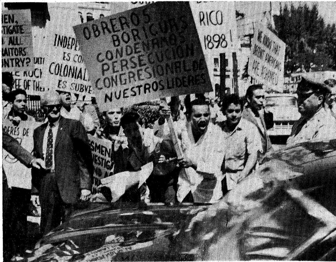
Pickets outside the San Juan courthouse protest the House Un-American Activities Committee's "investigation" of "Communism" in Puerto Rico. Shocked Puerto Ricans learned that the witch-hunters do not scruple about ransacking private mail and using the contents to smear individuals. Sign in the foreground says: "Puerto Rican workers — we condemn congressional persecution of our leaders." Another sign, in English, says: "We know that decent Americans are ashamed."