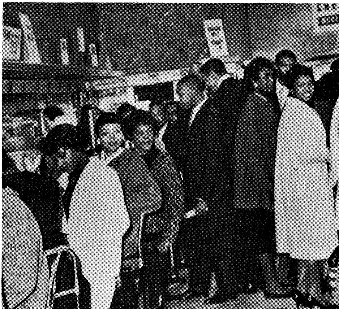
Negro students seek counter service at F. W. Woolworth Co. in Rock Hill, S. C., Feb. 12. Management refused service at the "whites only" bar and closed the counter. White racist youths jeered and heckled and threw an egg at the Negro demonstrators.