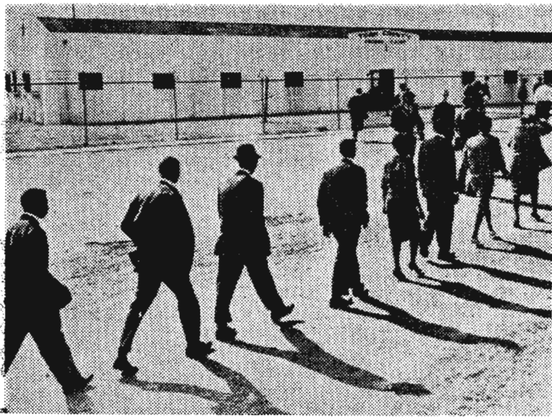
A few of the 500 visitors on Lincoln's birthday who called on 11 Negro students jailed at York County Prison Camp. The 11 defendants were arrested for trying to integrate lunch counters at Rock Hill, S.C. The visit marked the first anniversary of Rock Hill sit-ins.

Vol. 25 - No. 8 New York, February 20, 1961 Price 10c