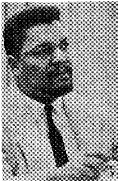
Robert F. Williams