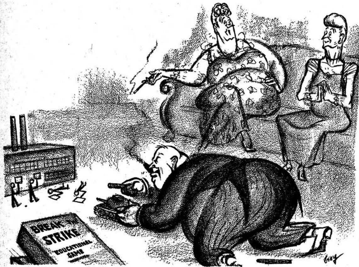
I was afraid he'd lose interest when the New York Post resumed publication. But he's wonderfully stubborn.

In our last issue we condemned President Kennedy as a strike-breaker because of his virulent attack on the New York printers.