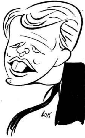
Robert F. Kennedy

"The Attorney General, Mr. Robert Kennedy, in his recent Civil Rights Report to the President, has claimed much in the way of achievement in this field. But as one from Mississippi, I would like to ask him just how much he has done to secure rights for Negroes to vote in my state. The increase in Negro registration in Mississippi since this administration has taken office is almost nil. Negroes are constantly being harassed, intimidated, attacked, and shot at because of their efforts to try to vote. Almost all the effectiveness of the Civil Rights Acts in the voting field has been