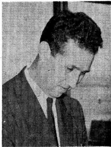
Ahmed Ben Bella

During the years of war, "native" capital grew considerably. According to one reliable source, Algerian capital expanded from 200 to 600 billion old francs (from $400 million to $1,200 million). For many reasons, this consists mainly of commercial capital engaged in foreign trade, in commerce, the services, etc. In Algiers this is seen in the transfer