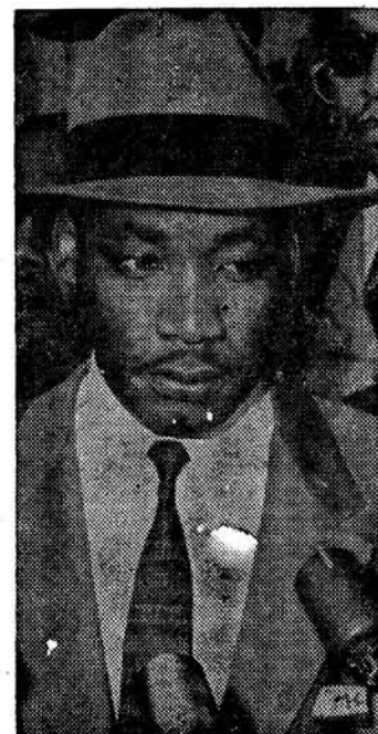
Martin L. King