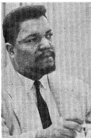
Robert F. Williams

This statement is a prime example of the kind of divisiveness the movement for social progress in this country could do without. For reasons of space, we take up only one of the above falsifications—the allegation that the Black Muslims and the white racists preach the same doctrine. Actually, the white racists preach segregation to maintain Negroes in oppression. The Black Muslims preach separation