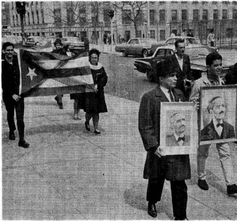
MOURN PUERTO RICAN LEADER. New York members of the Puerto Rican Independence organization, Movimiento Pro-Independencia, held a memorial march for the late Pedro Albizu Campos in East Harlem's Puerto Rican community April 25. About 100 participated in the march which ended with a street rally that coincided with the funeral for Albizu Campos in Puerto Rico.