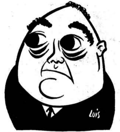
J. Edgar Hoover