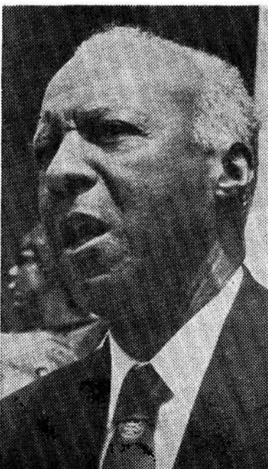
A. Philip Randolph

In announcing the White House visit, a spokesman for the delegation declared: "This Declaration is no mere scrap of paper. Most of the 4,500 signers have been actively working to end the war in Vietnam. We have no intention of quitting until the people of the United States stop this futile and immoral war, which President Johnson has described as brutal and dirty. If the government continues to step up military action, we will increase our efforts to persuade the people to withdraw their support from the government."