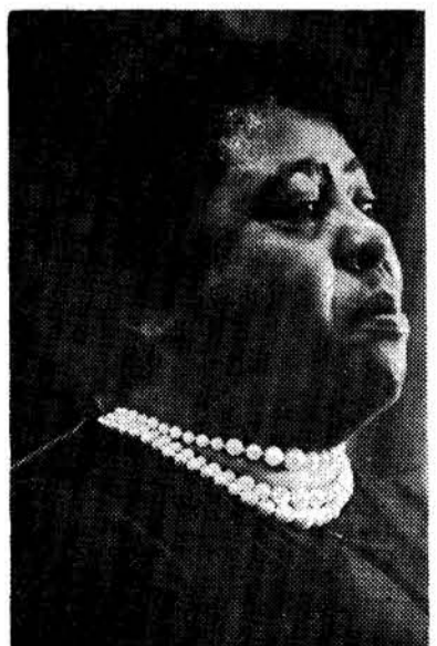
Fannie Lou Hamer