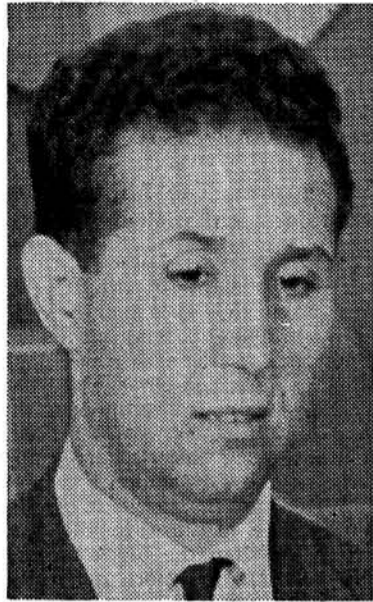
Ahmed Ben Bella

This is the root of the question. It could be objected that Ben Bella himself came to power in July 1962 under "nondemocratic" conditions. But the assertion is false. First of all, the provisional government replaced in 1962 was an assemblage whose relations with