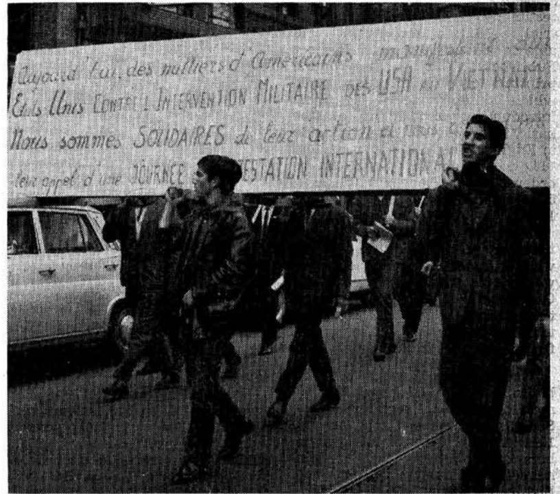
SOLIDARITY. Large poster carried at head of Brussels march read: "Today, thousands of Americans demonstrate in the United States against the military intervention of the USA in Vietnam. We are in solidarity with their action and we answer their appeal in favor of an International Day of Demonstrations."

BRUSSELS, Belgium ( World Outlook ) — Some 3,000 persons marched in Brussels Oct. 16 in observance of the International Days of Protest against U.S. military intervention in Vietnam called for by the Vietnam Day Committee of Berkeley, Calif. It proved to be the biggest demonstration in Europe.