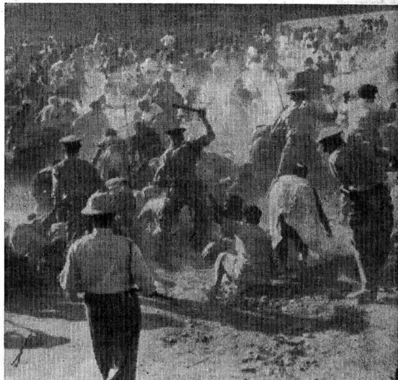
RACIST COPS IN ACTION. Durban, South Africa, 1959. Years of brutal repression have trained South African freedom fighters to develop organizations "invisible" to the white racist government and its extensive police apparatus.