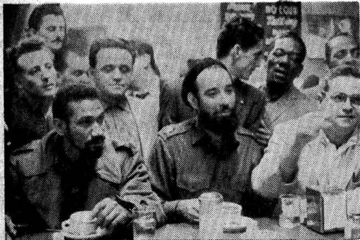
SET EXAMPLE. Major Juan Almeida, head of the Cuban army (left), and Antonio Nunez Jimenez, then Agrarian Reform director, at Harlem lunch counter during October 1960 visit to New York with UN delegation headed by Fidel Castro. Leading Cuban revolutionaries make a practice of not living on higher scale than rest of people.

The Independent Socialist Discussion Club is the only socialist club on a Los Angeles junior college campus.