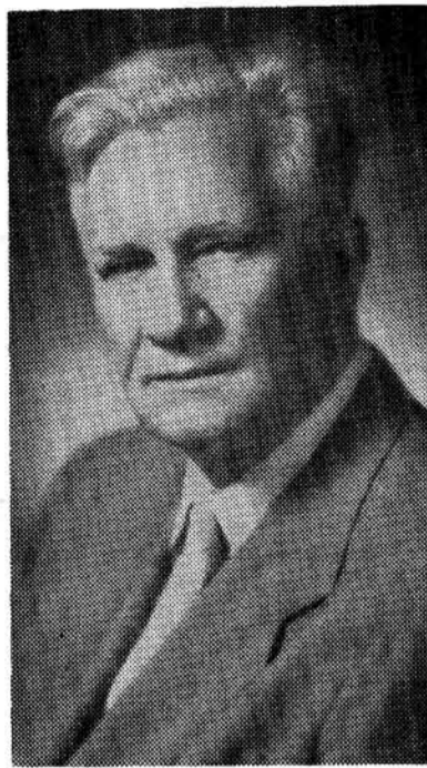
James P. Cannon

Recognizing the vital importance of the Minneapolis Case to the