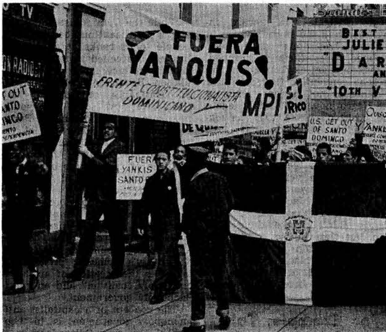
HIT U.S. AGGRESSION. Members of Movement for Puerto Rican Independence in New York join with Dominican patriotic groups in protesting U.S. invasion of Dominican Republic.

The present stage of our antiwar struggle, in what we call our "new struggle for independence," began in 1956 with the formation of the Federation of University Students for Independence (FUPI). This militant, anti-imperialist organization began by opposing the ROTC program at the university. It achieved its first victory in 1959 by forcing university authorities to put the ROTC program, formerly compulsory, on a voluntary basis. Since then, student participation in the program has greatly decreased.