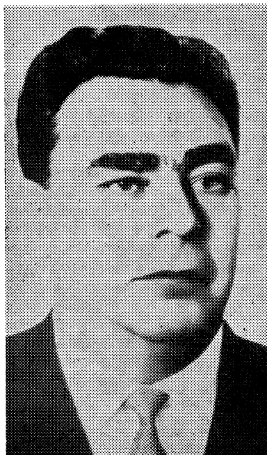
LEONID BREZHNEV, General Secretary of the Soviet CP. Neither Soviet nor Chinese CPs offer any explanation of catastrophic defeat in Indonesia.

onesia, it is possible to make a serious mistake in methodology. This is to confine the analysis to the Indonesian scene alone, leaving out the international context. Such an error would emphasize what is peculiar to the archipelago and tend to obscure the general pattern that applies to other countries as well. It would likewise tend to isolate Indonesia from the overall context of international events and block an understanding of the reciprocal play of cause and effect on a world scale.