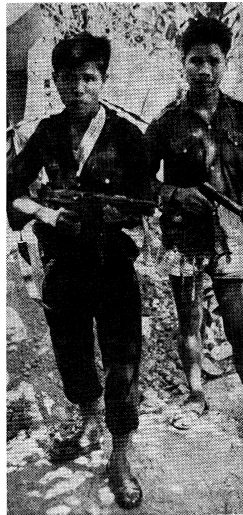
FREEDOM FIGHTERS IN SOUTH VIETNAM. Struggle of Vietnamese revolutionaries has been made more difficult by defeat in Indonesia.

On the documents themselves, a word should be added as to authorship. Ernest Mandel is the editor of the Belgian socialist weekly La Gauche . He has written extensively on political and economic subjects of interest to the revolutionary socialist movement. His book Traité d'Economie Marxiste won him a firm reputation throughout Europe as a