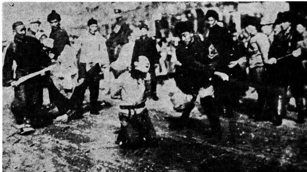
CHINA, 1927. Counter-revolutionary terror unleashed by Chiang Kai-shek is depicted in this horrifying beheading of worker by Chiang's butchers. Untold millions were slaughtered after Chiang's coup d'etat of April 12, 1927. Victory of counter-revolution resulted from Stalinist policy of "united front" with the butcher Chiang.

The third document was written by a young member of the Indonesian Communist Party who succeeded in making his way into exile. His analysis of Aidit's policies is of the greatest interest not only in the material it provides as a guide for further study but as an indication of the determination of an important sector of the Indonesian Communist Party to learn from what happened and to utilize the lessons in such a way as to ensure victory when the masses again surge forward, as they surely will.