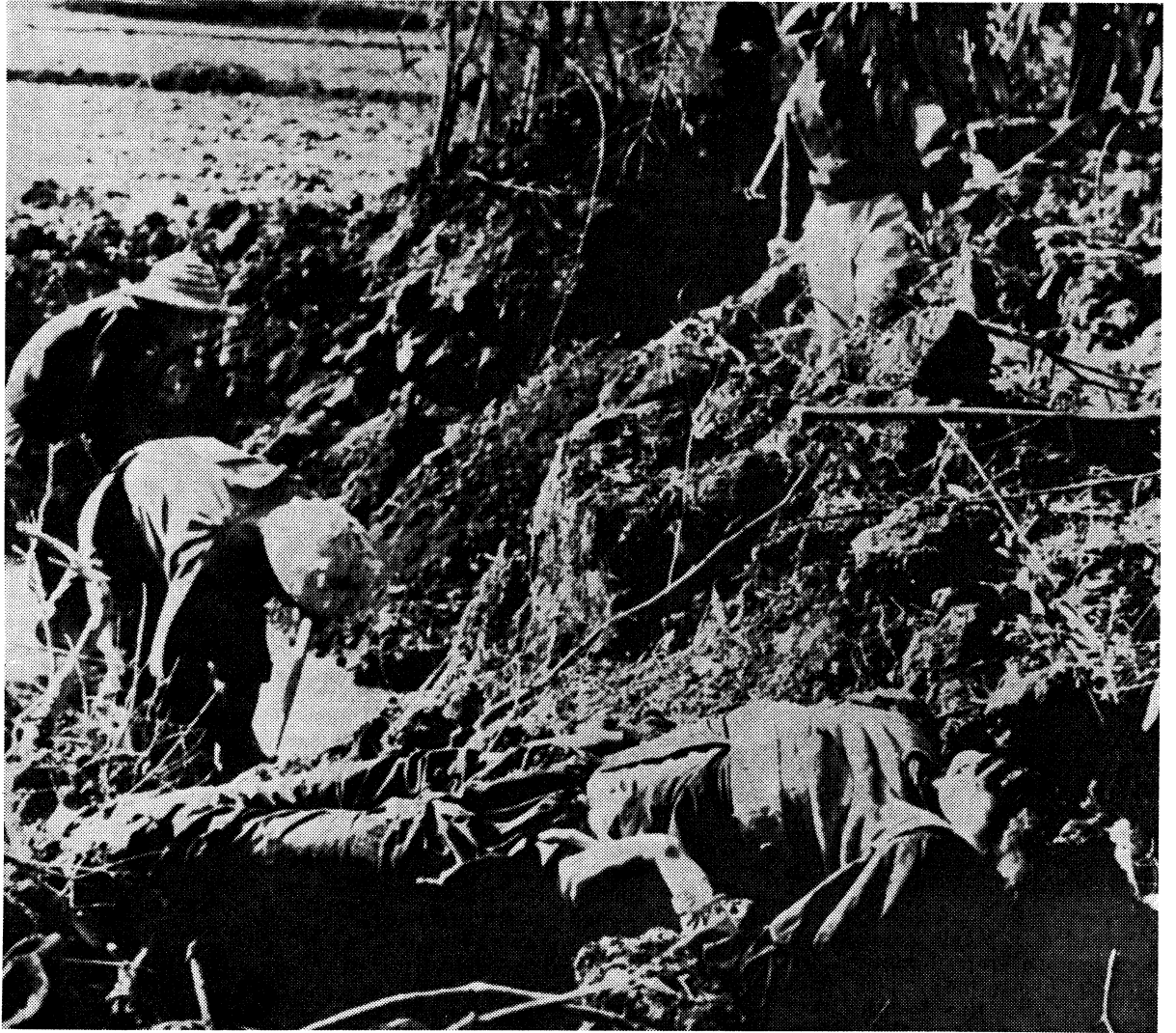
VICTIM OF U.S. BOMBING. One of the civilian casualties of Dec. 2 U.S. raid on residential suburb of Hanoi. Washington still denies it carries out such raids.