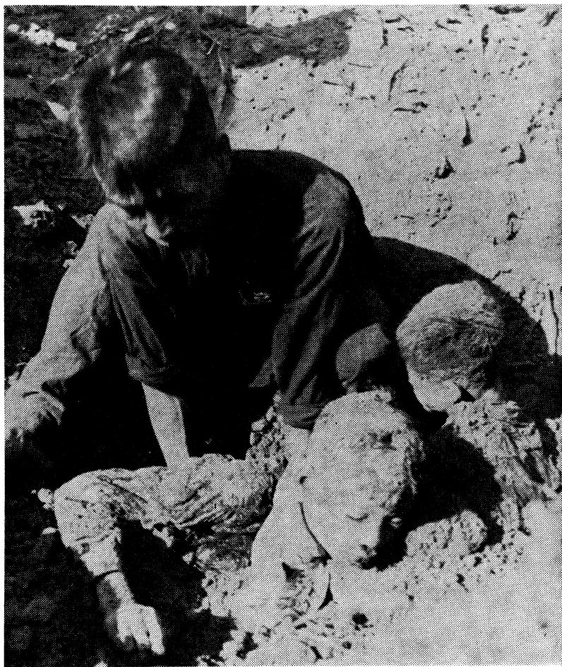
SCHOOL CHILDREN BOMBED. U.S. still maintains it bombs civilians only by "accident." Here, rescue worker digs out two children after U.S. air raid on their school in Thai-binh, North Vietnam. Forty persons were reported killed, including 30 students.

"When asked to cite instances in which civilian areas have accidentally been struck, officials also said they did not know of any particular instances," the Dec. 27 New York Times report con-