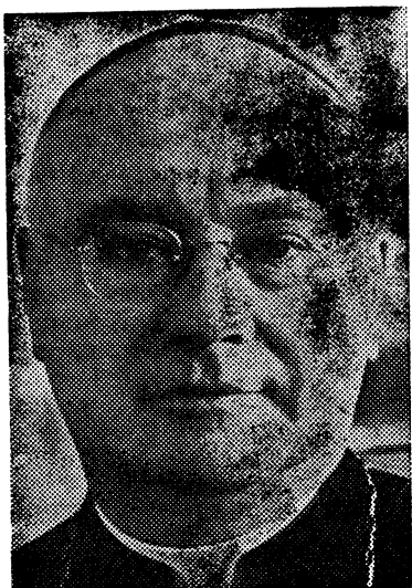
Francis Cardinal Spellman

The cablegram said in part: "We demand that Hugo Blanco and all the other political prisoners be freed immediately. Militant democratic opinion in Sweden expresses its solidarity toward the Peruvian people and its struggle for democratic rights. We condemn corruption in Peru, repressions against the people by your government and neocolonialist domination of the economy and official political life of your country by the United States."