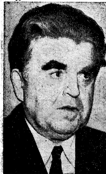
JOHN L. LEWIS