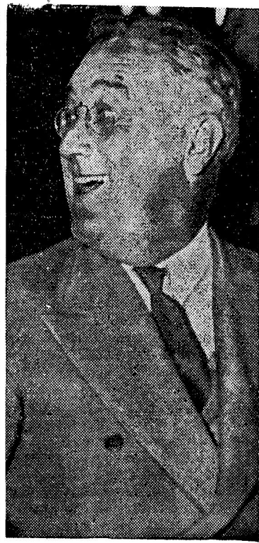
F. D. ROOSEVELT