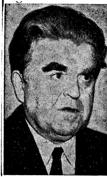
JOHN L. LEWIS