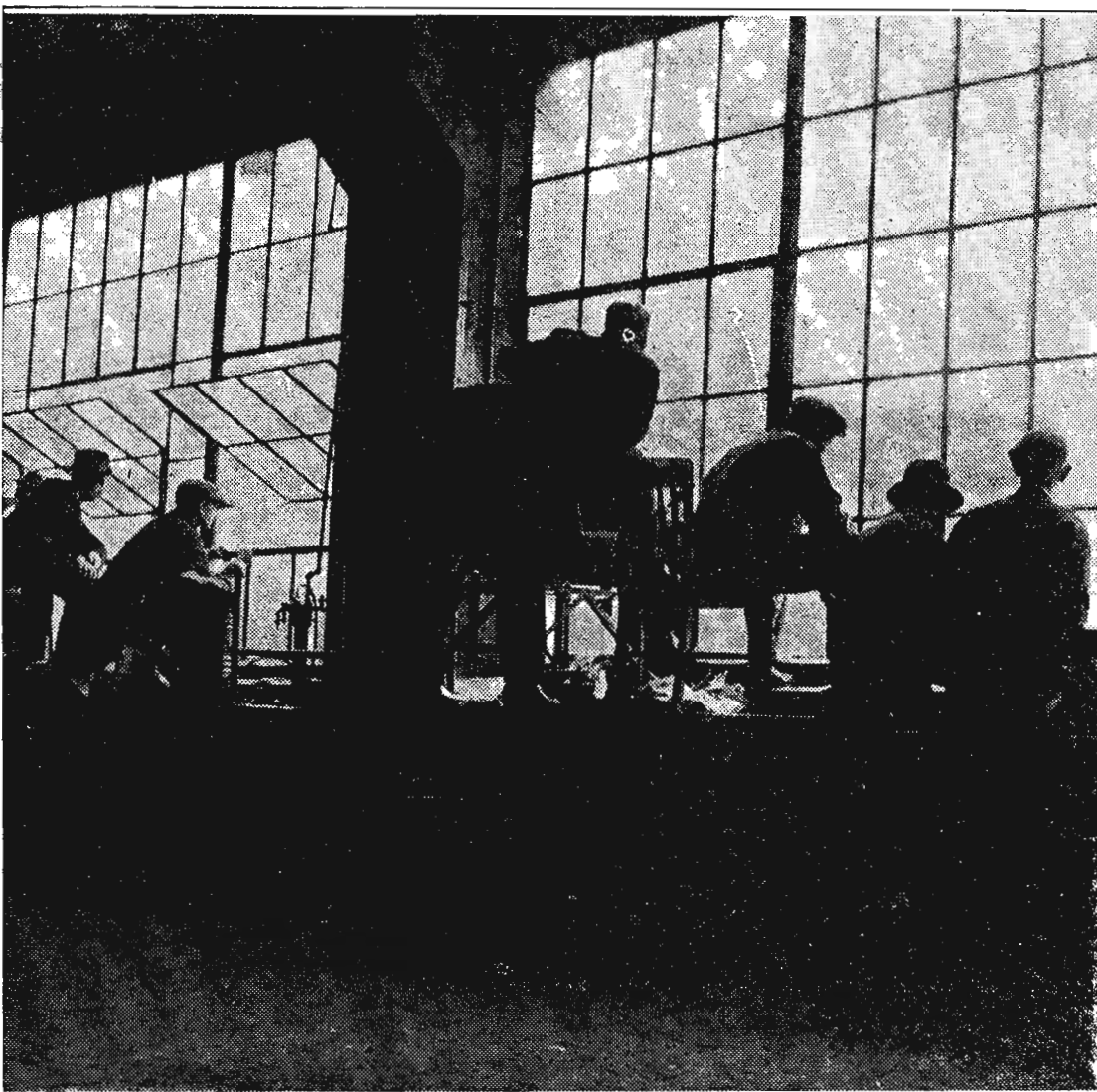
Sit-down strikers at Fisher Plant No. 2 watching the street from a second story window during the great strike battle of 1937 in Flint, Mich., which was then patrolled by troops. Winning the first encounter with city police, the strikers took possession of the factory.