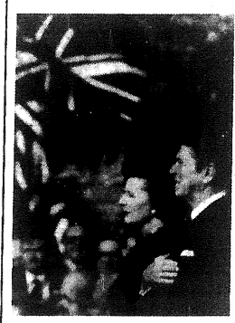
British Prime Minister Margaret Thatcher with her ally Ronald Reagan.

British Prime Minister Margaret Thatcher's Conservative Party won a landslide victory in national elections held on June 9. The Conservatives received 42 percent of the nopular vote, winning 397 of the 650 seats in Parliament. Their 144-seat majority in Parliament is the largest won by any British party since 1945. The major opposition party, the Labour Party, won only 28 percent of the vote and 209 seats its worst showing since 1922. A third grouping, the recently formed Liberal-Social Democratic Alliance, won 25 percent of the vote, but will hold only 23 seats due to electoral laws that penalize third