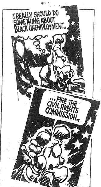
JUNE 15-JULY 14, 1983/TORCH/PAGE 3

Since 1980, the commission has become increasingly critical of the Reagan administration. It termed Reagan's 1983 budget "a new low point in a disturbing trend of declining support for (Continued on page 5)