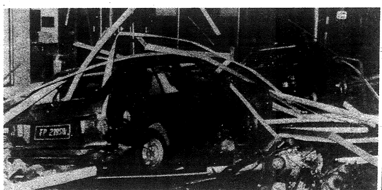
South African Air Force headquarters in Pretoria was heavily damaged on May 20 by bomb plante

In March, the commission charged that the White House was obstructing its