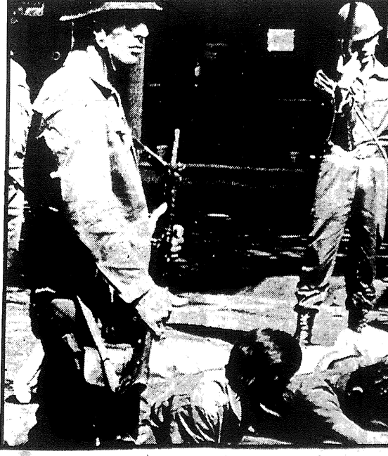
Soldiers humiliate left-wingers arrested in massive street demon

First came the capit of Obregón and Lón governor and deputy nor. When Perón indic support for the coup sistance collapsed. Oset the tone for servil tations: "I am still a sthe great hope of the (Perón) and I do not