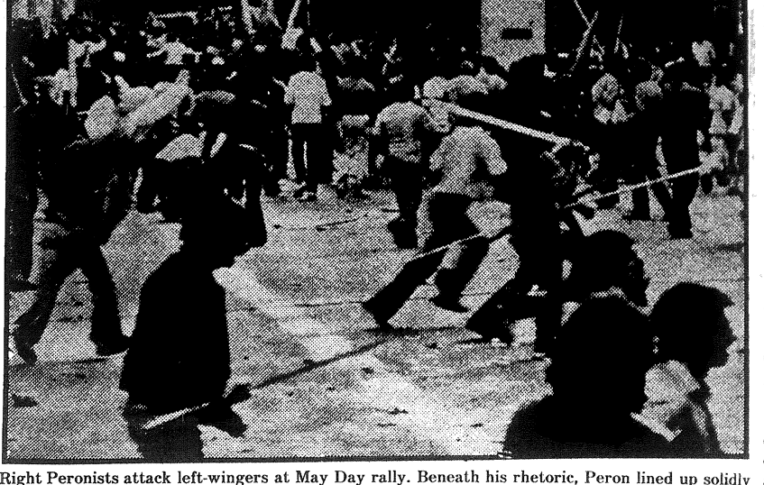
Right Peronists attack left-wingers at May Day rally. Beneath his rhetoric, Peron lined up solidly with the rightists.

Peron angrily responded to criticisms within his movement by pointing out how cooperative the opposition was in comparison. It is no wonder. From September to