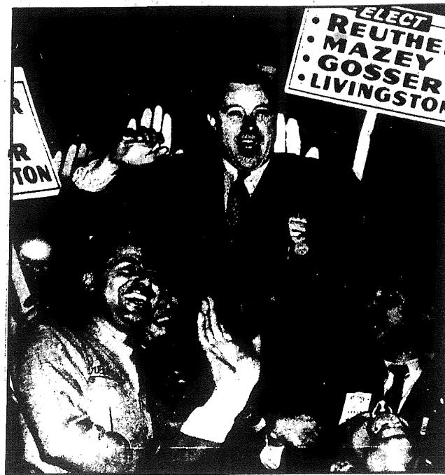
Walter Reuther, hoisted by UAW workers when he swent to power at 1946 auto workers' convention. UNC still fosters illusions about Reuther.

Far more dangerous and opportunist than the UNC is the newly-formed Auto Workers Action Caucus, supported by the Communist Party. The CP, through AWAC, is positioning itself to take advan-