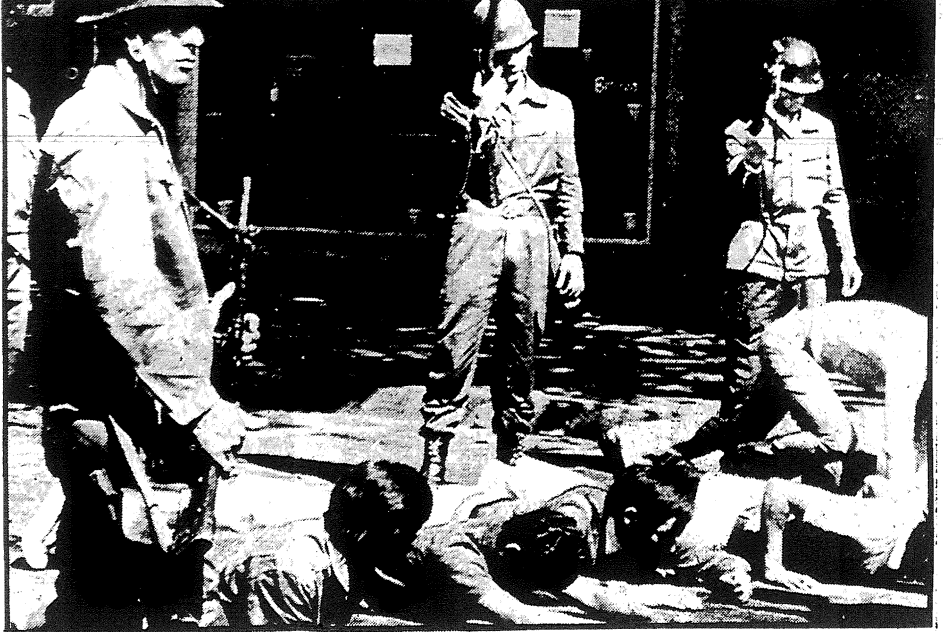
Soldiers humiliate left-wingers arrested in massive street demonstrations in Mendoza, Argentina last April.

We mobilized as never before to bring back Perón and win the elections, to defend the military and begin a process of social justice and liberalization, eliminating our economic dependence. And we won. The Peronists of Cordoba won a Peronist governor and deputy governor from the working class who was in the struggles. And all of us Cordobeses, with the same drive that we showed in the Cordobazo, put our shoulders to the wheel to develop a revolutionary program of reconstructing Cordoba and country; and suddenly everything has fal-