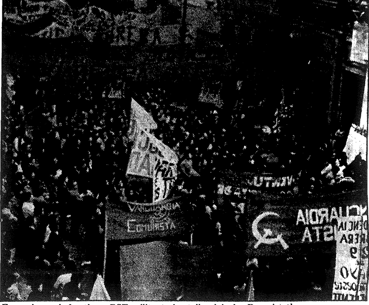
Funeral march for three PST militants brutally slain by Peronist thugs.