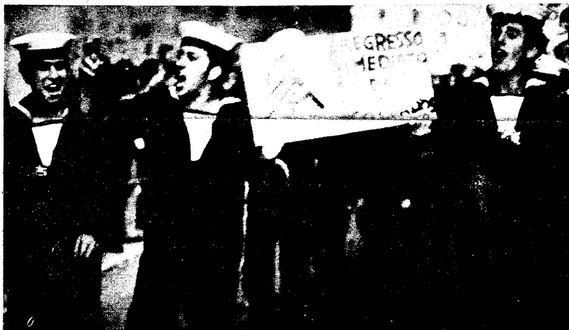
STREET DEMONSTRATION BY PORTUGUESE SAILORS

WITH THE WORKERS IN THE COUNTRIES OF THE SOCIALIST CONQUESTS!