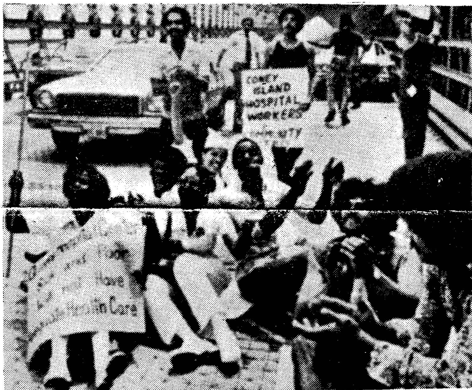
HOSPITAL WORKERS BLOCK BROOKLYN BRIDGE