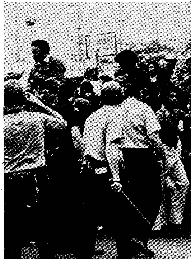
COPS ATTACK ATLANTA DEMONSTRATION

Its goal -- Against the capitulation of the Dobbs-Hansen leadership of the Socialist Workers Party to the Pabloites and its attempt to dissolve the International Committee: the defense of the struggles of the workers in the countries of the socialist conquests against the