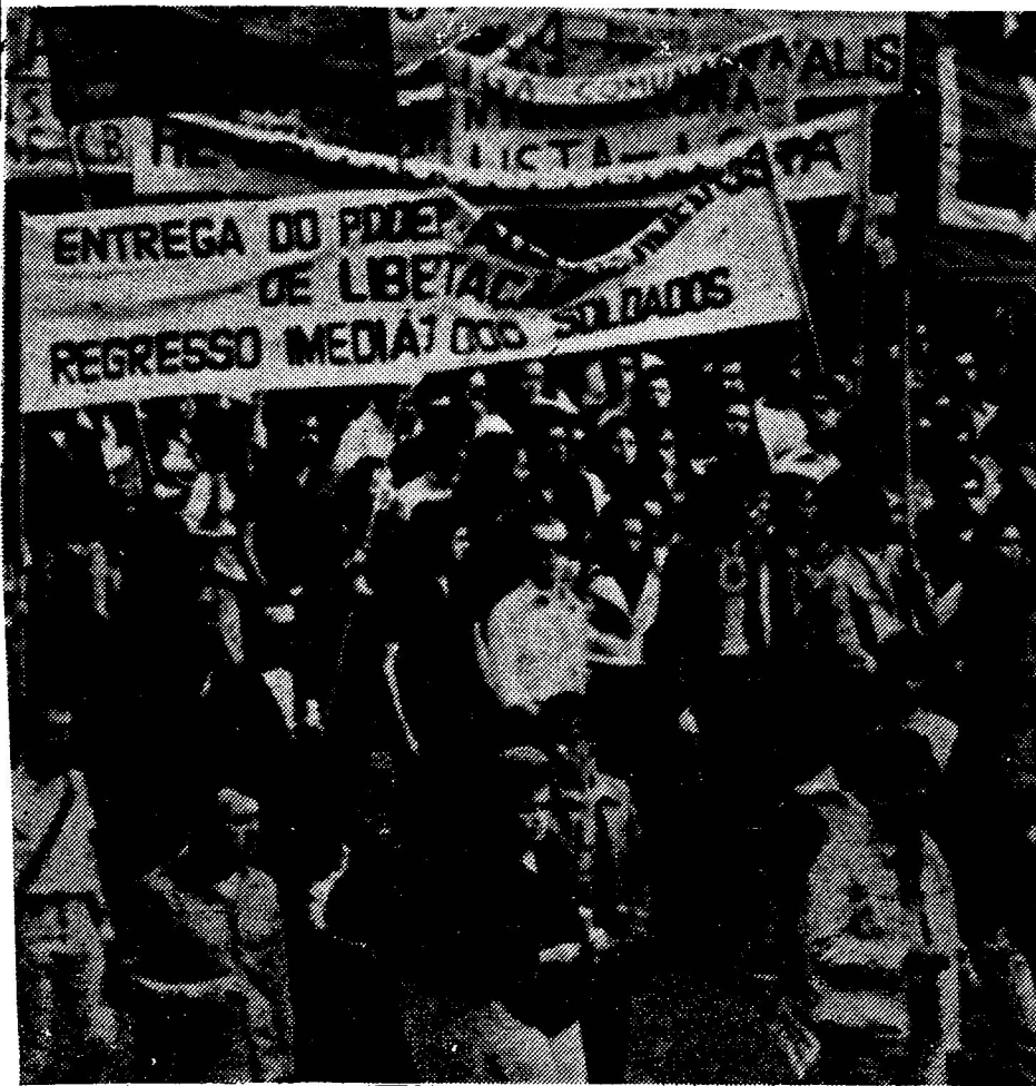
MAY DAY DEMONSTRATION IN LISBON